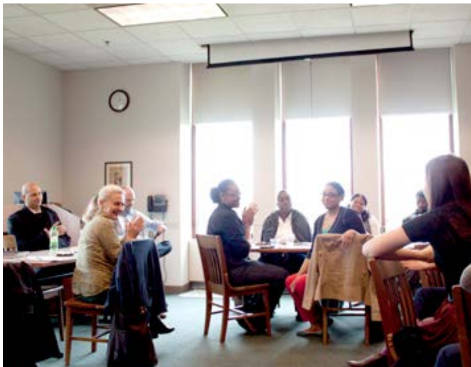
MALS/IDS Students and Alumni celebrate our 2012 Graduate Students.