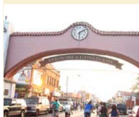
A Sample of Chicago's Gateways: Chicago Stock Exchange, Chinatown, Union Stockyards, Little Village