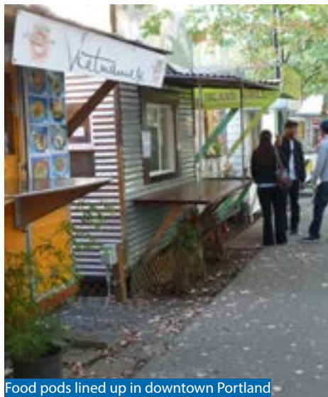
Food pods lined up in downtown Portland