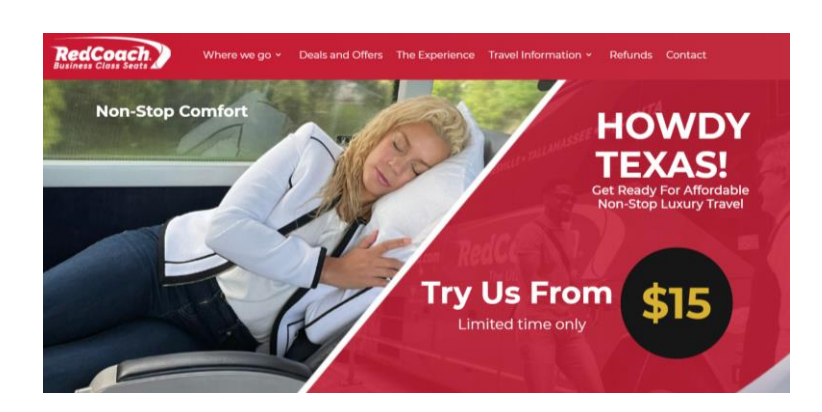
A RedCoach website photo featuring its generously reclining first-class seats

c. Multimodal ground operator Landline expanded bus service linking Ft. Collins, CO, and Denver International Airport (DIA) to five daily for its "codeshare partner" United Airlines.