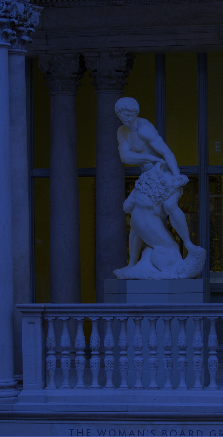
THE WOMAN'S BOARD GR