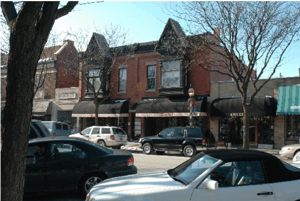
Main Street Glen Ellyn – Distinctive Historic Roof Lines

3.1 For building in the C5A district, follow the “Standards for Rehabilitation and Guidelines for Rehabilitating Historic Buildings” from the U.S. Department of the Interior, National Park Service.