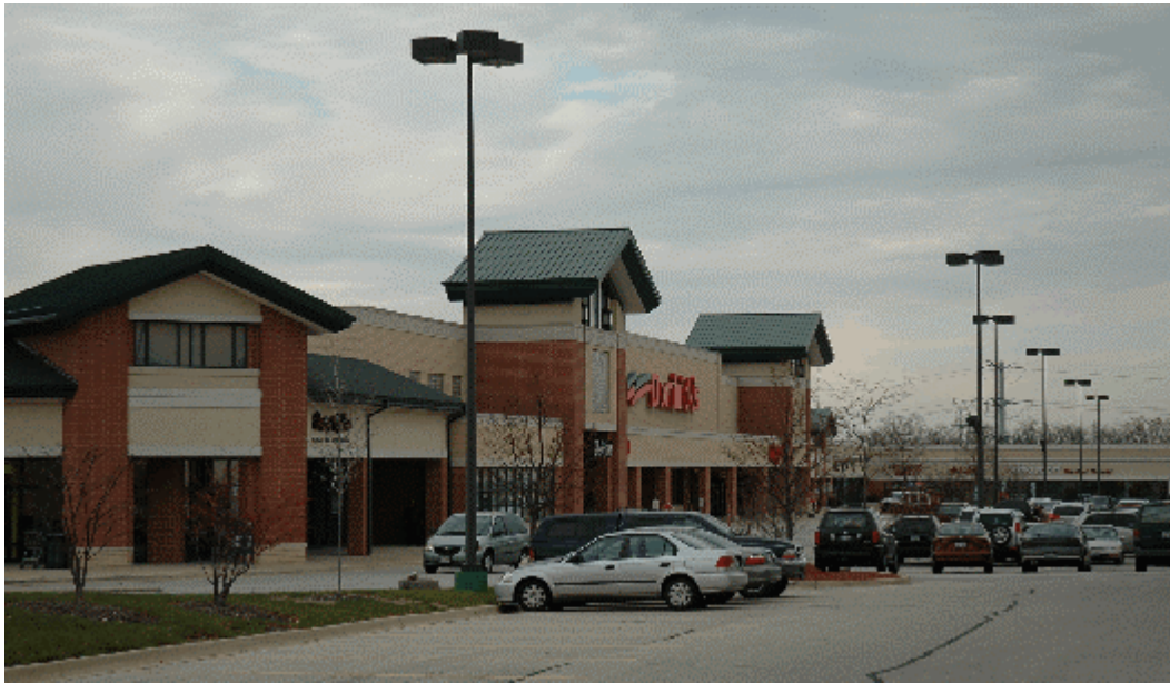
Baker Hill Shopping Center

Larger, highway oriented commercial development is of a different character than that which occurs within the more densely developed up portions of the Village. There is more open space on the site, buildings are widely separated, there are accessory structures such as dumpsters, and there are additional considerations needed to safely serve both auto and pedestrian needs. The general principles and site design guidelines of Chapters 1 and 2 as well as the awning and wall signage guidelines of Chapter 3 also apply.