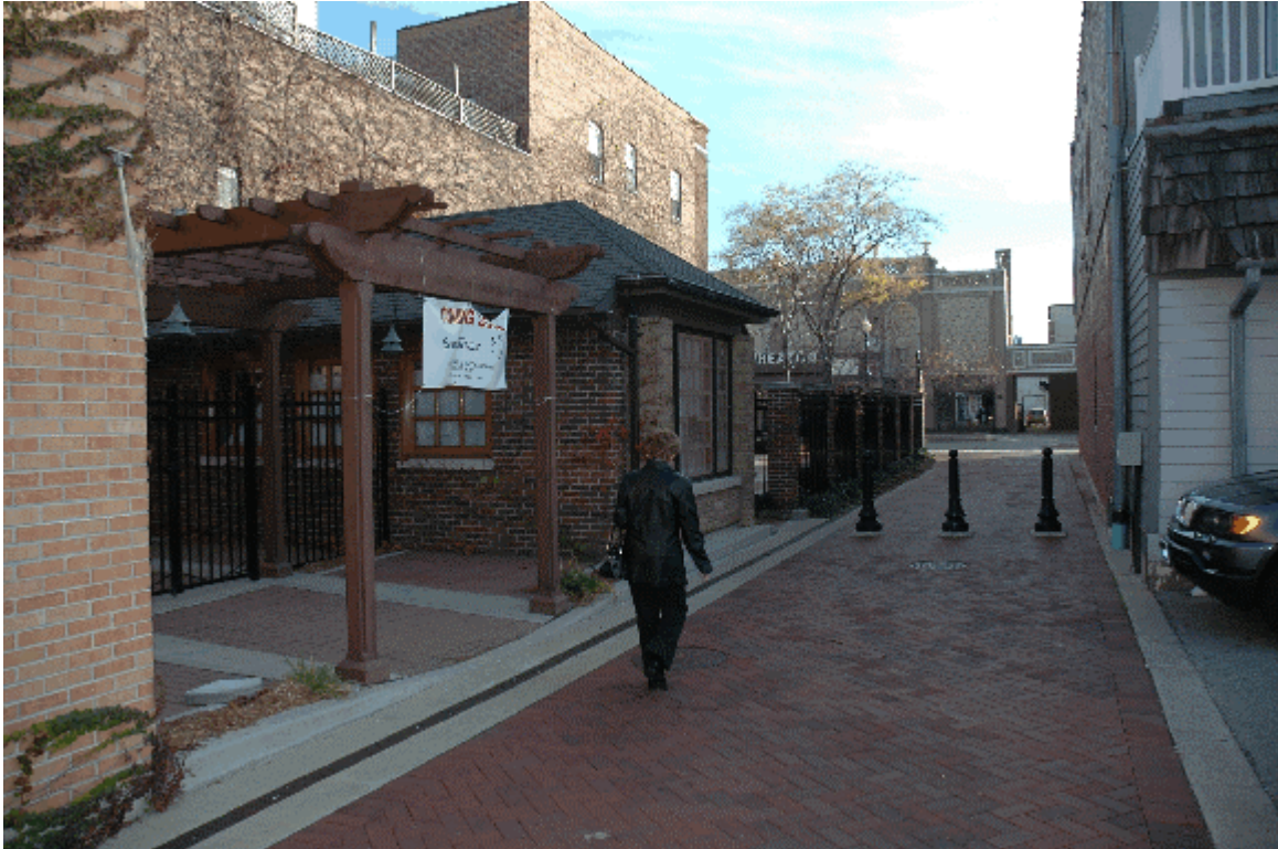
Attractive Alley Access in Wheaton

3.10 Rear customer entries should be enhanced. Design possibilities include: pavement design to designate pedestrian access; landscaped islands to separate the walkway from vehicular movement in parking and service areas; transparent doors; low level lighting; an identification sign; painted or screened air conditioners; and color styling to match the front entrance.