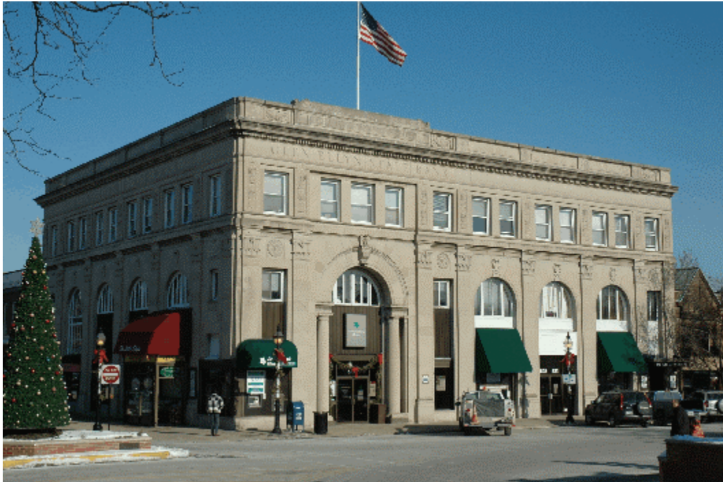
The Tallest Building in the Historic C5A District

The importance of maintaining the unique character and identity of the downtown is reflected in the fact that the Zoning Code requires that “all unimproved land or addition to existing structures must be developed as a Planned Development, Special Use”. The downtown is divided into two zoning districts.