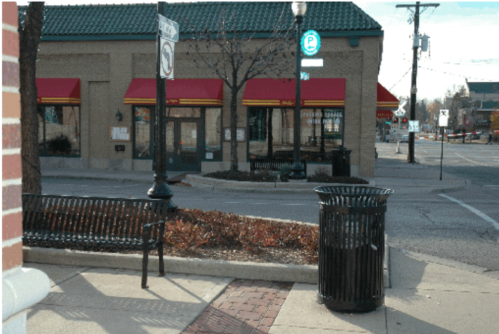
Site Furnishings, Commercial Building, Downtown Wheaton

2.5 Site furnishings (waste receptacles, benches, bike racks etc.) should be selected to relate to each other and to the principal building in terms of material, color and style.