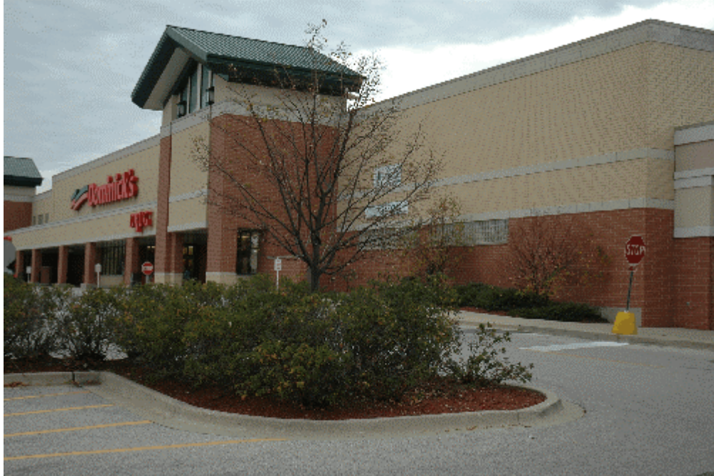
Landscaping Which Defines Parking and Enhances Blank Wall

2.1.5 Landscaping of an area at least five feet in width should be employed along blank building walls. This can help to soften the building facade, define pedestrian ways and frame key entries to a building. Where space is not available, free standing planters should be substituted.