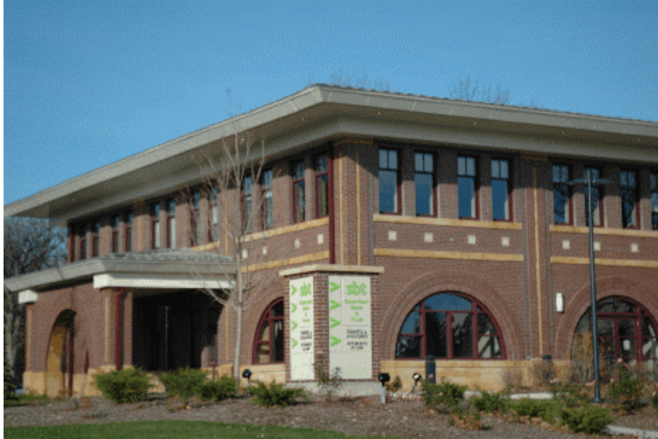
Office Building County Farm Road With Clear Definition of Roof and Wall Planes