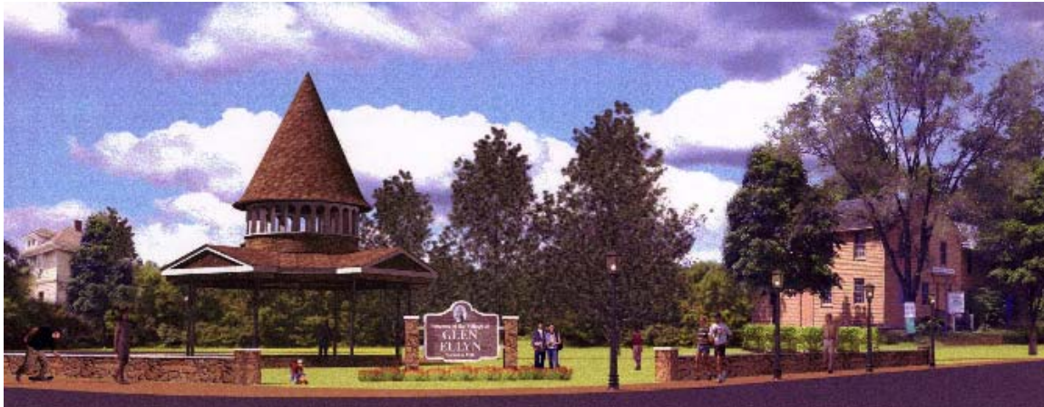
Glen Ellyn History Park – Conceptual Rendering*