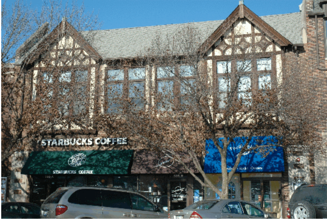
Appropriate Wall Sign Placement, Starbucks – Downtown Glen Ellyn

3.12 Wall signs should be placed so that they are surrounded by the wall surface on which they are placed. The primary sign should be located between the 1st and 2nd floor. Signs painted on walls are prohibited by the Sign Code. Signs should not project above or beyond the roof or wall line nor obscure the continuity of decorative stone or brick bands across the building face. The sense of the surrounding wall should remain intact. Individual letters are suggested in contrast to more contemporary box signs. External lighting is preferred for wall signs. Lettering on an awning valance is also a good solution for identification signage. Corporate logos should be allowed when they are consistent with the overall design guidelines.