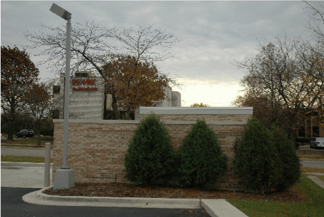
Effective Screening of Garbage Enclosures, McDonalds, Roosevelt Road

4.2 Views of parking, loading, trash pick-up and mechanical equipment should be buffered and screened from public view.