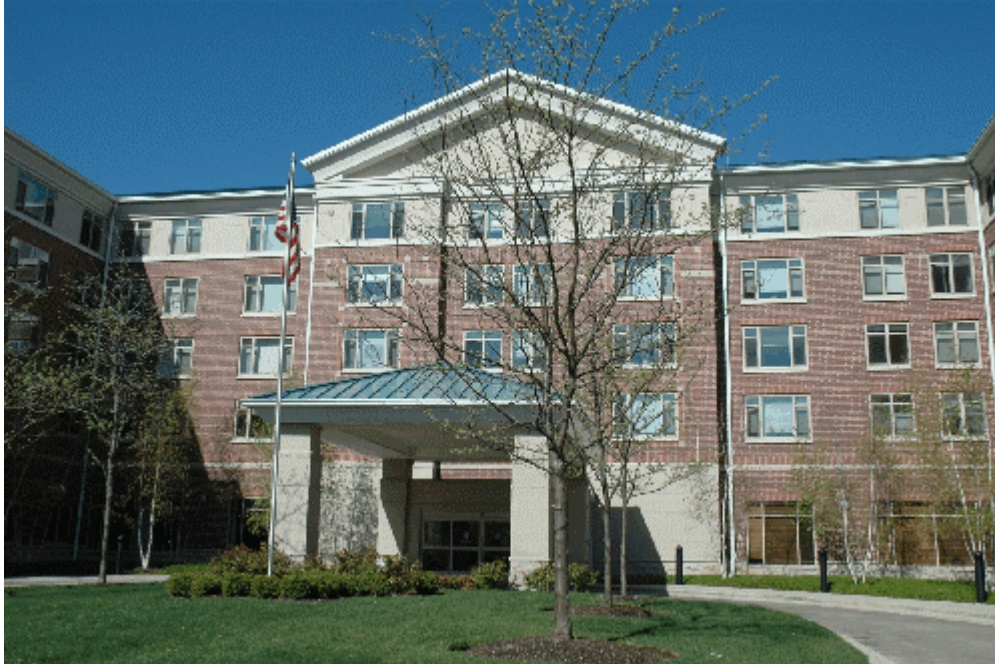
All Masonry Construction and Defined Entrance Way - Senior Housing, Glen Ellyn

The general guidelines of chapters 1 and 2 also apply.