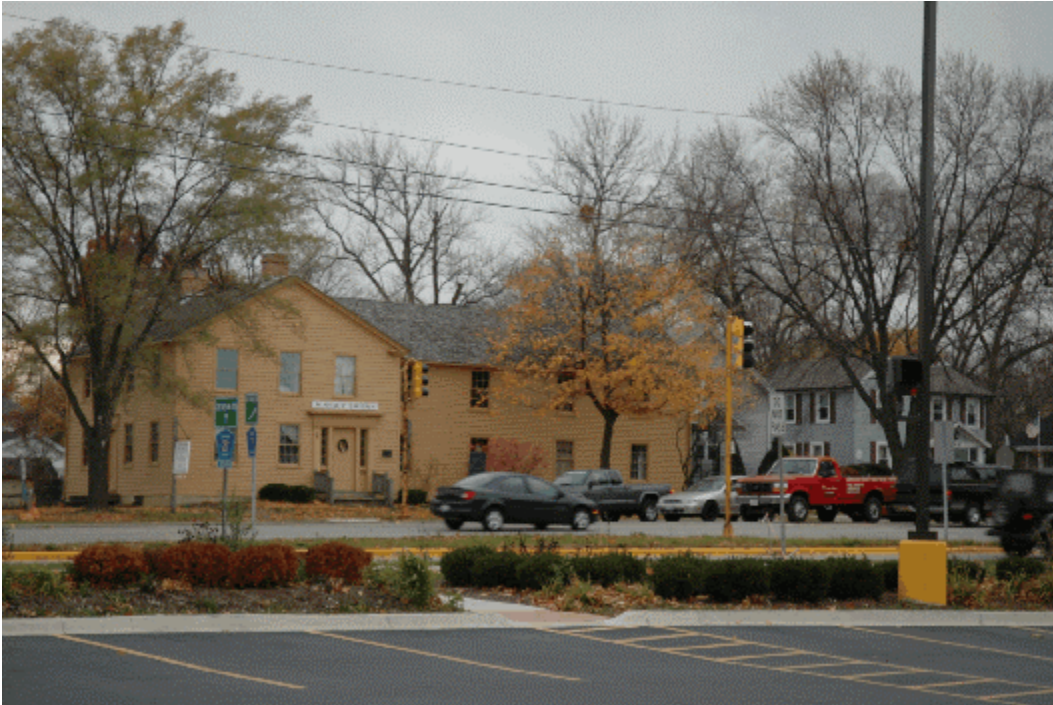
Stacy's Tavern, National Register of Historic Places

This area has been a commercial crossroad for over a century. Stacy’s Tavern is a National Register structure which is the basis for a planned Glen Ellyn History Park which will incorporate a variety of structures and public spaces designed to reflect 19th and early 20th century architecture. Concept plans for this History Park can be found in Appendix D .