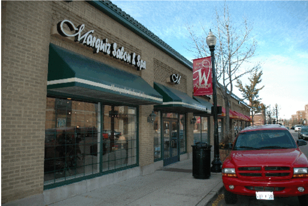
Well Placed and Designed Wall Signage, Front Street – Downtown Wheaton