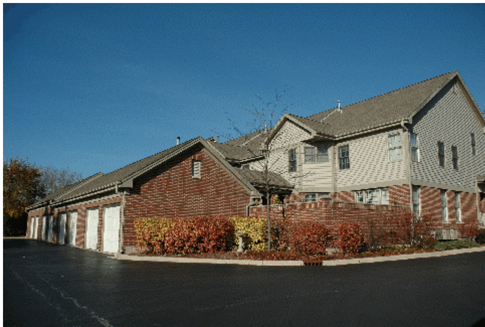
Local Brick Townhouses with Cedar Accents and Rear Entry Parking

7.5.1 Rear or side loaded garages reduce the dominant appearance of front garages and landscaped parking courts or clusters should be considered for supplemental resident and guest parking.