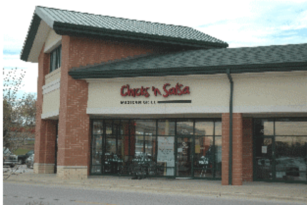
Appropriate Tenant Signage, Protected Entry, and Defined Roof Line, Baker Hill

2.4.6 Wall mounted signage should be placed within an area designed for its placement which does not cover architectural detailing or rise above the roof plane.