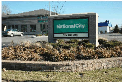
Ground Monument Sign Relating to Building Design, Roosevelt Road

2.4 Signage is governed by the Village Code. To compliment these standards there are also guidelines which effect the aesthetic quality and readability of signage.