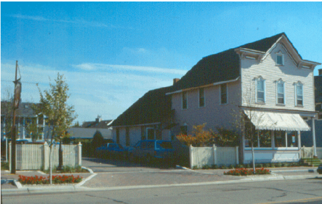
Wood Sided Commercial Building of Appropriate Era, Itasca Historic District