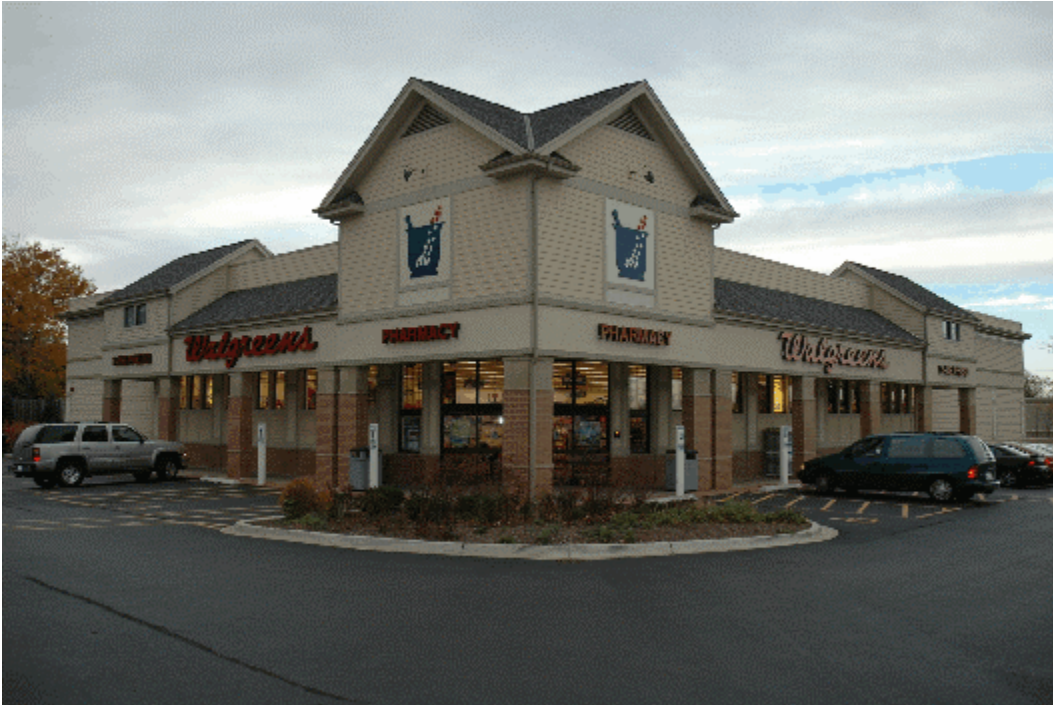
Appropriate Scale, Materials and Landscaping, Walgreens Five Corners

5.3 Parking should be planned behind or between buildings to the fullest extent possible so that the buildings can be placed closer to the street and the pedestrian walkway.