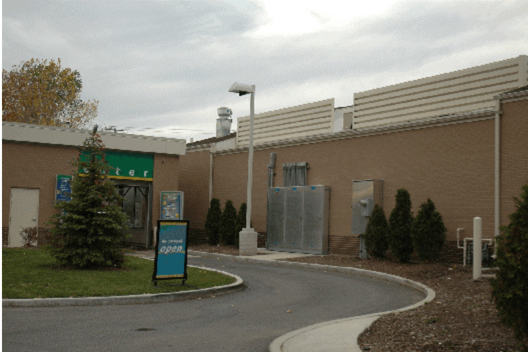
Attractive Back Side of Local Business

2.3.2 Free standing transformers and utility boxes should be painted to blend with the landscape or the primary building and be screened with landscaping.