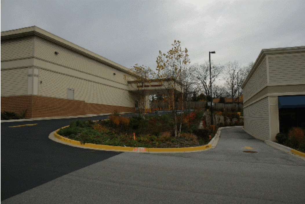
Good Landscaped Grade Transition and Screening for Adjacent Uses

1.1.1 Existing trees should be identified and protected as a part of project planning and implementation.