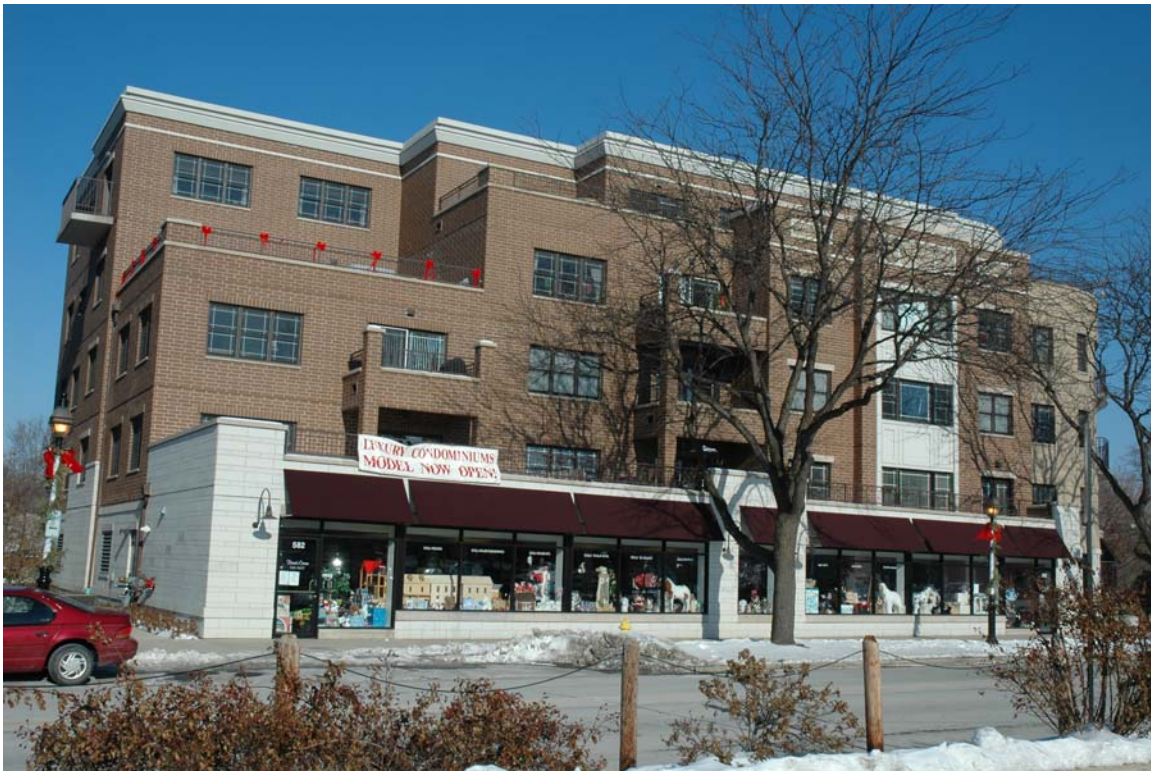
Condominium Development With Ground Floor Retail in the C5B District

buildings. New buildings or additions within this district should follow the architectural style of the original building if it is of historic value. If there is new construction or remodeling of a building of undistinguished style, the design should reflect one of the historic styles of adjacent or nearby buildings. Once a historical style has been determined, the petitioner should consider the characteristics of that style as described in various references in Appendix C , and demonstrate the compatibility and consistency of their proposals with the selected style.