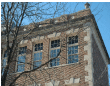
Glen Ellyn Civic Center Detailing