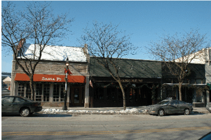
Well Proportioned Awnings, South Main Street

3.6.2 If walls are to be painted, one color should be used for all of the wall surfaces to establish the continuity of the basic volume and mass of the building. A palate of colors appropriate for buildings within the C5A is available from the Planning and Development Department. See also Appendix A for information on what activities require ARC review.