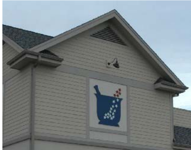
Appropriate Wall Signage – Stacy's Corners Historic District

2.4.5 For wall signs not in historic districts, individual affixed letters, light in color and contrasting with a darker surrounding background, are suggested. Illuminated box signs are discouraged.