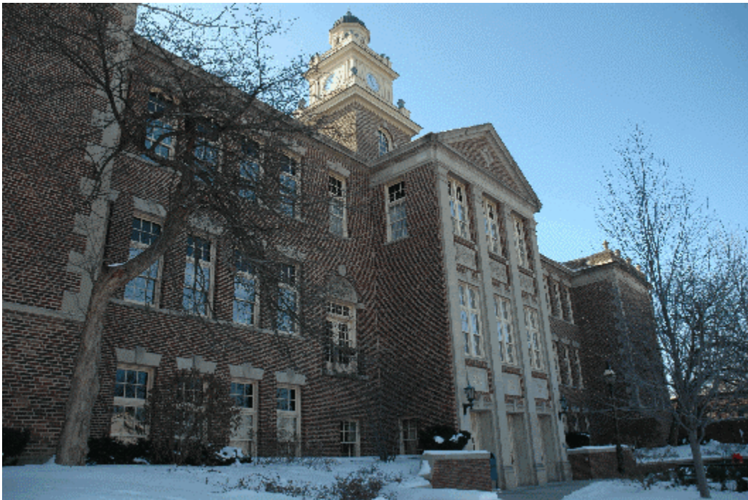
Glen Ellyn Civic Center, A Visual Landmark

Public and institutional buildings are major contributors to the character of Glen Ellen. The Civic Center, high school and dozens of churches are prime examples of visual landmarks with which residents identify. Glen Ellen’s character is strongly influenced by these key community buildings. A sense of stability, permanence and character should be projected by public and institutional buildings.