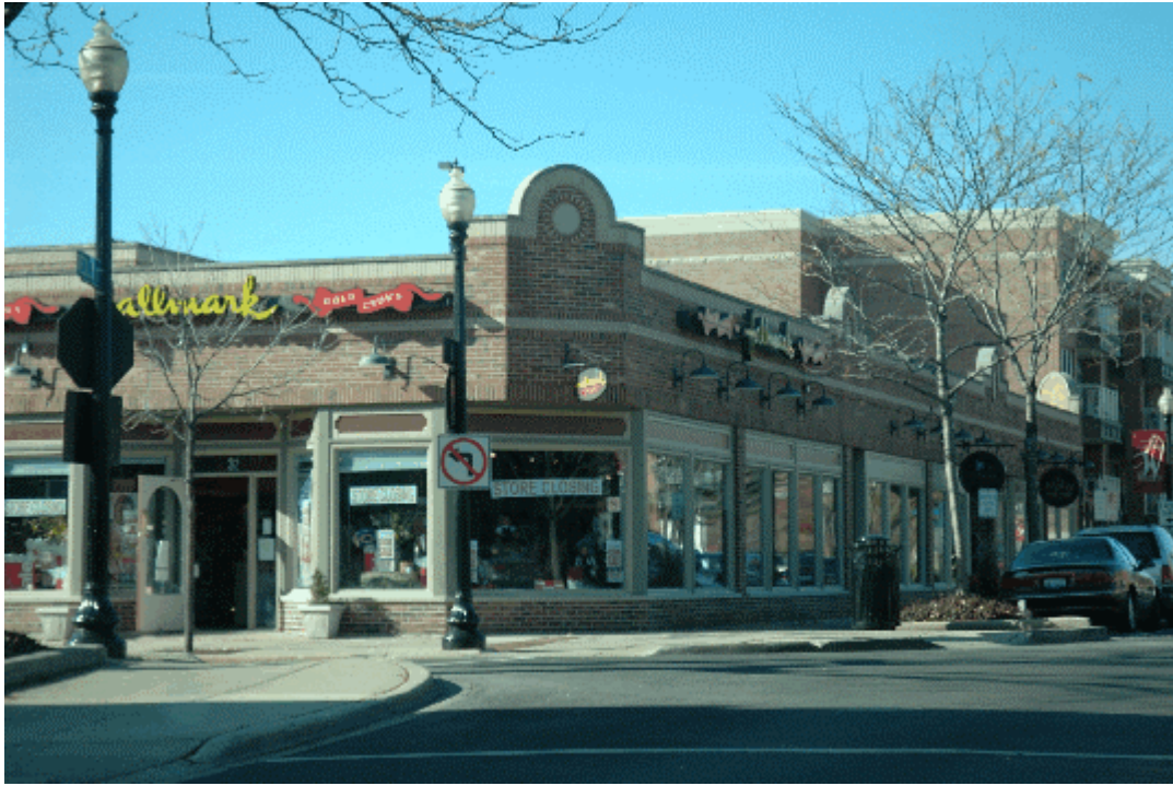
In-fill Development Reflecting Appropriate Time Period – Historic Downtown Wheaton