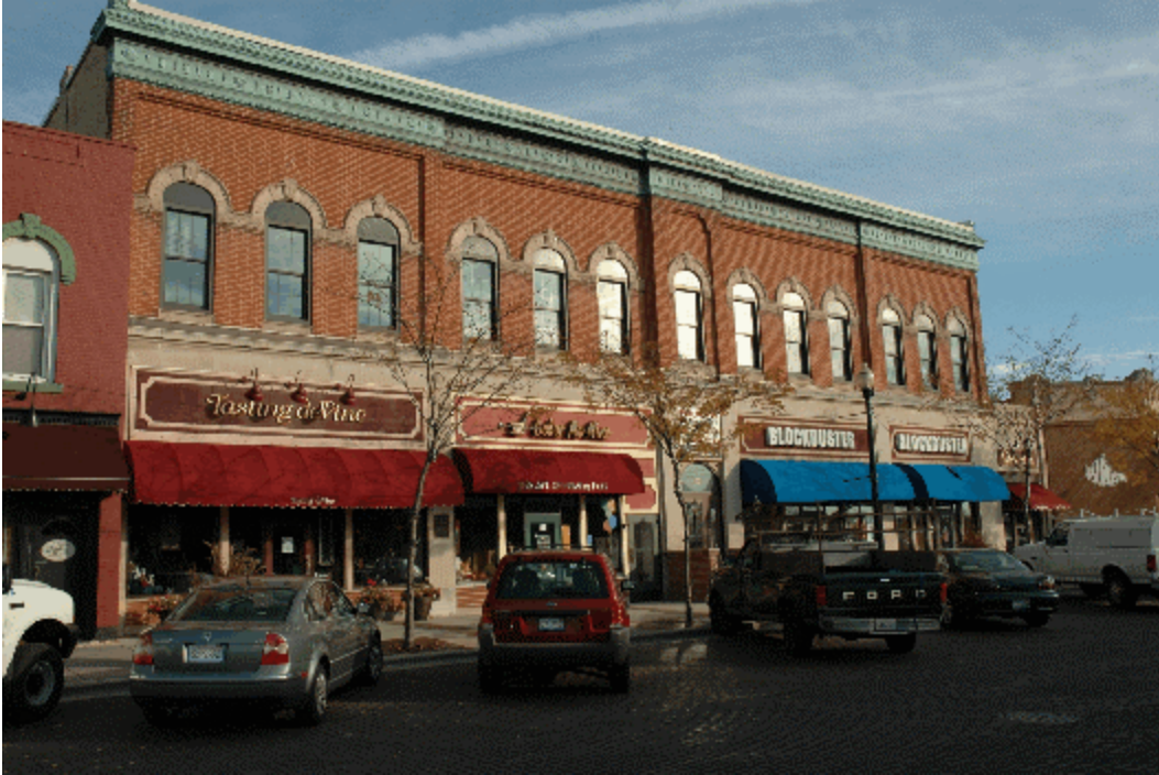
Examples of Respect for Original Openings, Attractive Roof Cornice and Appealing Sign Friezes, Wheaton

3.3.1 If openings become obsolete, they should not be filled with incompatible materials such as common brick or glass block. Shutters can be fixed over second story openings where the owner wishes them to remain permanently closed. Infill panels which do not structurally change the original opening, can be used to fill window openings on the upper floors but the material, texture and color should fit within the original opening and blend with the rest of the facade. If shutters are appropriate to the architectural style of windows, they should be proportioned so that they would cover the opening if closed.