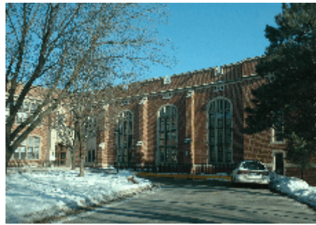
Original High School Building

6.2 Expansion, additions and remodeling of existing structures of distinctive or historic architecture should emphasize compatibility with the original structure in terms of roof structure, materials, openings and detailing. The Village desires to capture the historic character of these buildings with all of their rich detailing and attention to scale and proportion. These buildings exhibit the qualities which Glen Ellyn seeks as an overall design image: quality, durability, attractiveness and compatibility.