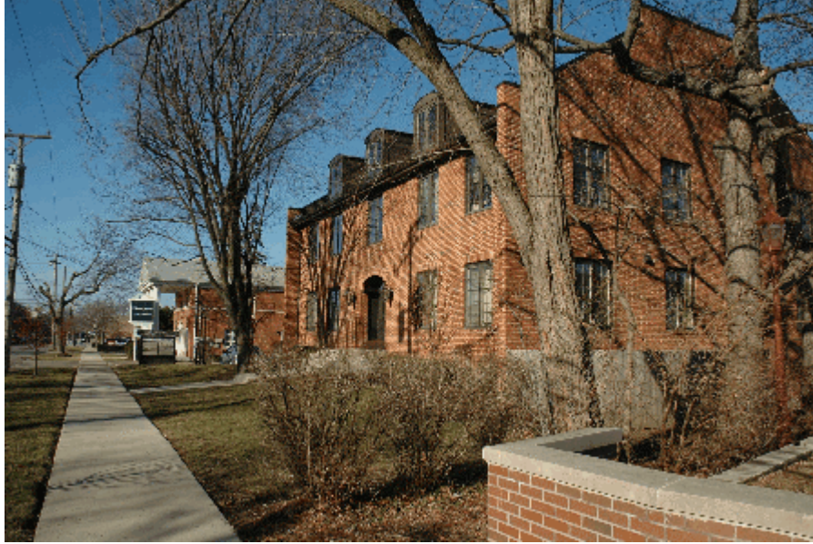
All Brick Office Building, Duane Street

1.2 Brick and stone with natural and earth tone colors are preferred wall materials for their durability and quality. Materials and finishes not recommended include: rustic-finished wood; aluminum siding, trim or panel systems; exposed aggregate concrete wall panels; EIFS, Dryvit; glass storefront wall systems which extend to the ground; plastic trim elements; and mirrored or reflective glass. Ease of maintenance should also be considered. Also consult the Comprehensive Plan, page 45 for downtown buildings.