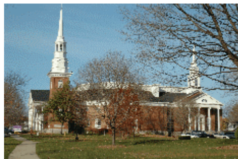
Wheaton Bible Church, Compatibility of Addition With Original Revival Design