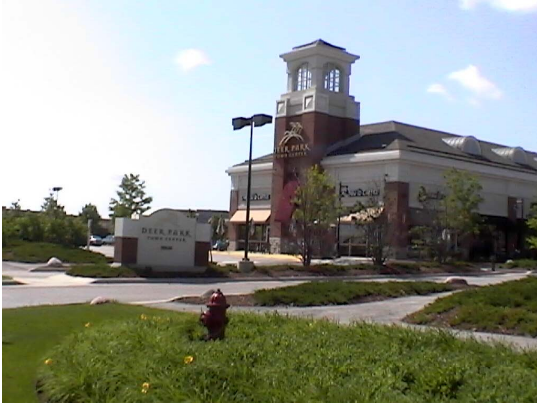
Monument Sign Relating to Building Design, Deer Park