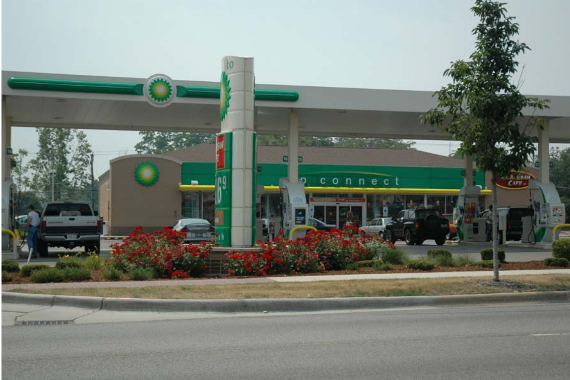
Unified Design & Streetscape Consistent with Roosevelt Road Improvement Plan BP Gas Station and Wild Bean Café – Roosevelt Road

4.5 All development adjacent to Roosevelt Road should implement, or restore, the Roosevelt Road streetscape elements, in order to achieve continuity of public improvements. Where re-development has occurred, the purpose and intent of the original design should be respected while providing appropriate access between the buildings and the public sidewalk.