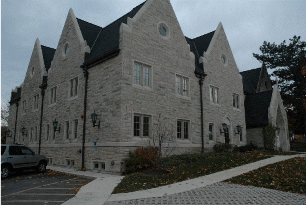
St. Mark's Episcopal Church Addition

6.1 New structures should also follow the general guidelines of Chapter 1 and 2. Construction within or adjacent to the C5A and C5B districts should also follow the guidelines of Chapter 3.