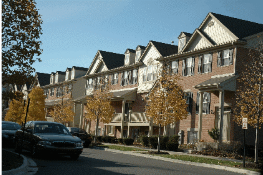
All Masonry Construction and Defined Entrance Way, Wheaton Center