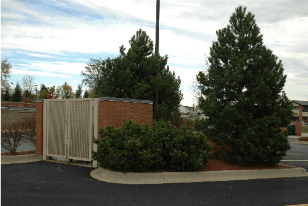
Well Designed and Landscaped Trash Enclosure – Baker Hill

2.3.1 Trash enclosures should have wall surfaces which match the material of the principal building and metal gates, and, wherever possible, have their opening oriented away from public rights-of-way and primary customer views. All trash enclosures should be surrounded by landscaping.