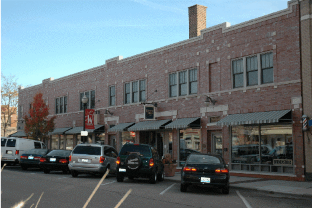
Compatible Remodeling of Historic Structure, Knippen Building in Wheaton

3.4 Original building materials should not be covered and new construction should use the same or similar materials as on the original building in terms of type, texture and color. Particularly inappropriate are veneers of artificial stone, metal panels, vinyl siding, rough sawn wood and stucco applied over brick surfaces. If applied only in patches as accents, they break up the continuity of the wall surface and can serve as a trap for moisture, thereby creating deterioration of the original underlying surface.