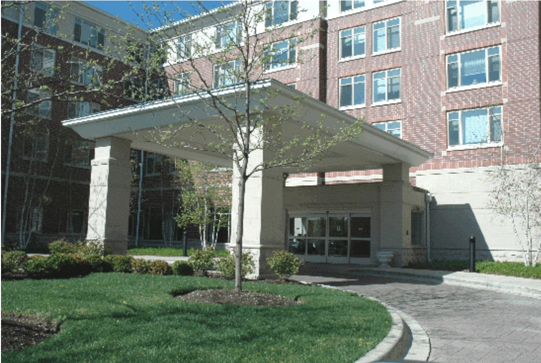
Landscaped and Defined Entry

1.6 Entrances should be readily identifiable from parking areas and pedestrian approaches. They should be open, well lighted and highlighted by the building structure, awnings, canopies, lighting and/or architectural detailing.