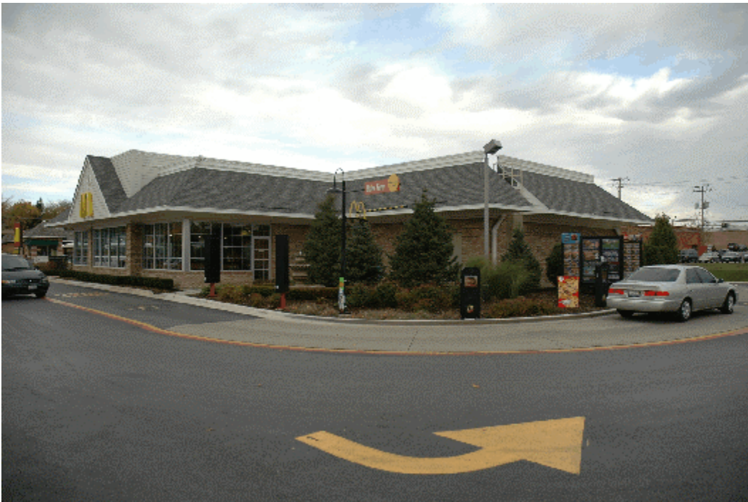
McDonalds – Roosevelt Road Attractive Landscaping of Drive Through Area

2.1 Landscaping, utilizing recommended plant materials identified in Appendix B, should be provided to enhance a project, buffer utilitarian views, and screen private areas of nearby residential property from visual intrusion.