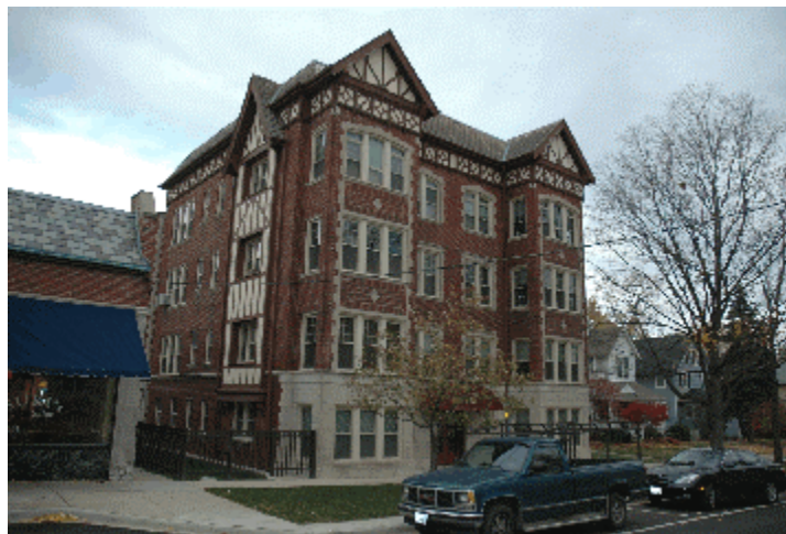
Apartments on Hillside Avenue with Distinctive Architectural Detailing

3.4 Original building materials should not be covered and new construction should use the same or similar materials as on the original building in terms of type, texture and color. Particularly inappropriate are veneers of artificial stone, metal panels, vinyl siding, rough sawn wood and stucco applied over brick surfaces. If applied only in patches as accents, they break up the continuity of the wall surface and can serve as a trap for moisture, thereby creating deterioration of the original underlying surface.