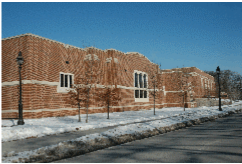
Glenbard West High School Addition Compatible with Original Building

6.1 New structures should also follow the general guidelines of Chapter 1 and 2. Construction within or adjacent to the C5A and C5B districts should also follow the guidelines of Chapter 3.