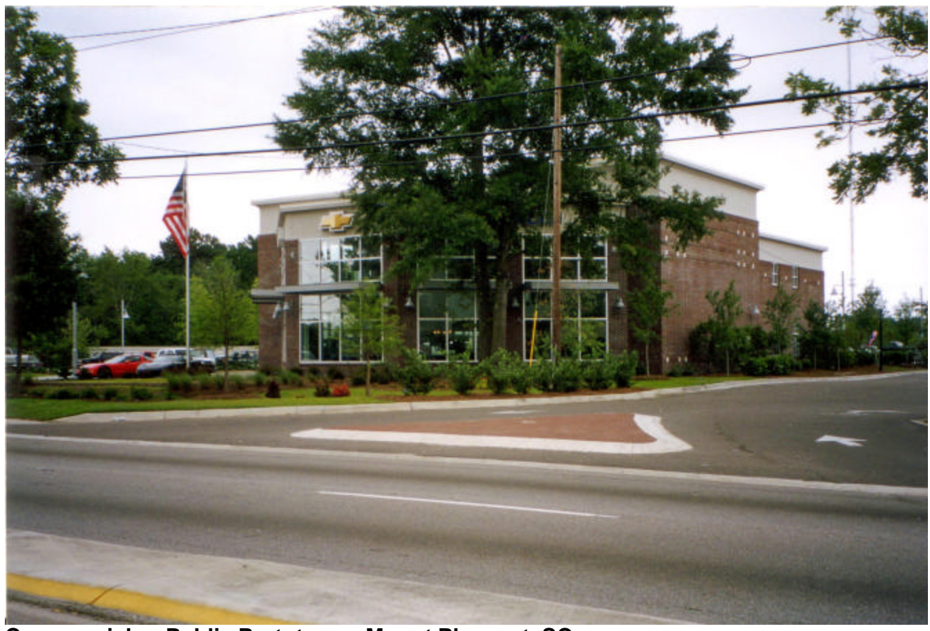
Commercial or Public Prototype – Mount Pleasant, SC