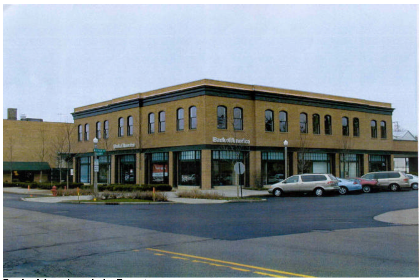
Bank of America – Lake Forest