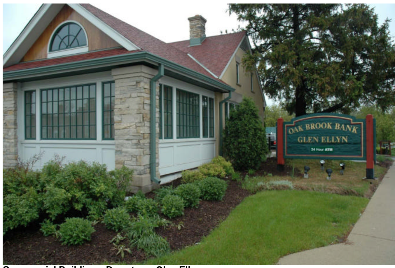
Commercial Building – Downtown Glen Ellyn