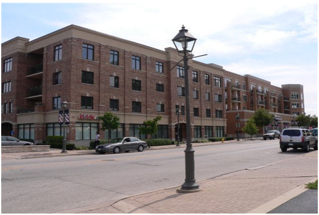
Mixed Use- Downtown Lombard