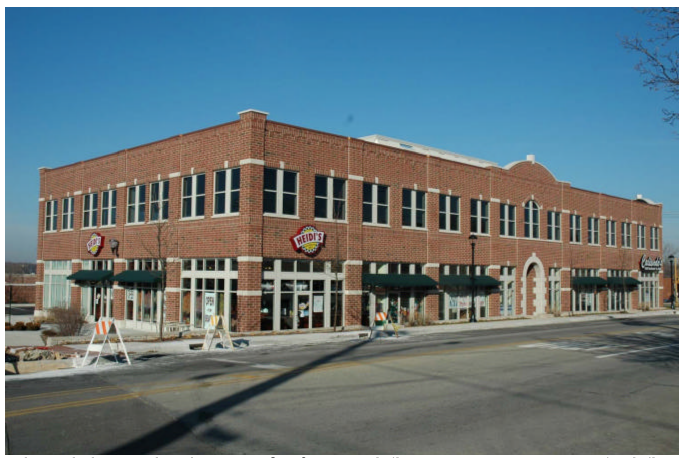
Brick Building on Historic Theme, SW Corner, Winfield Road and Jewell Road? Winfield