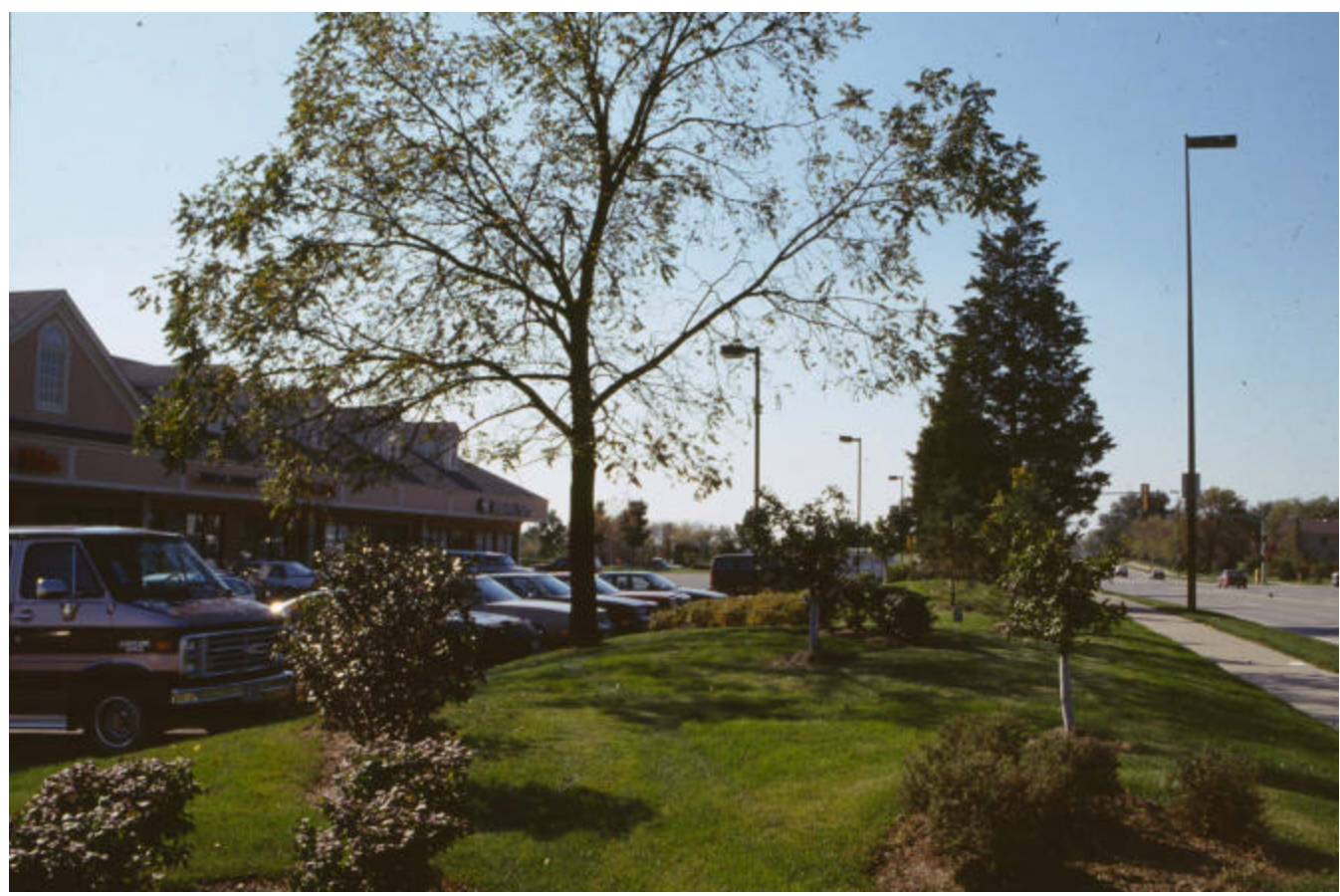
Retail Center, Schick and Springfield – Bloomingdale