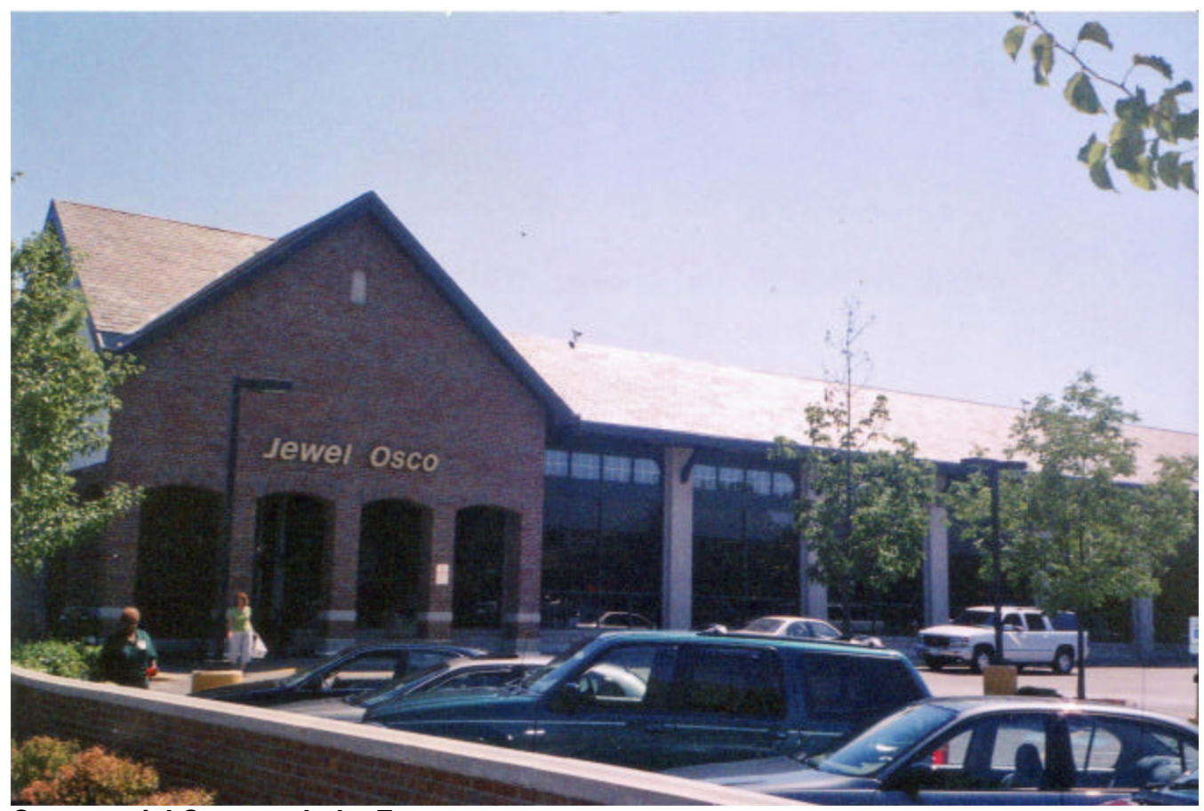
Commercial Center – Lake Forest