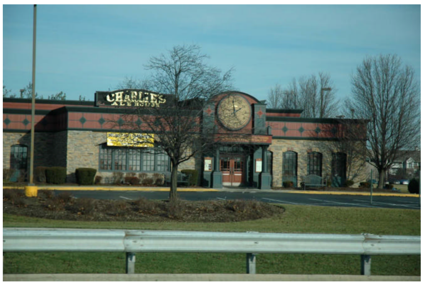
Restaurant, Danada East, Butterfield Road – Wheaton