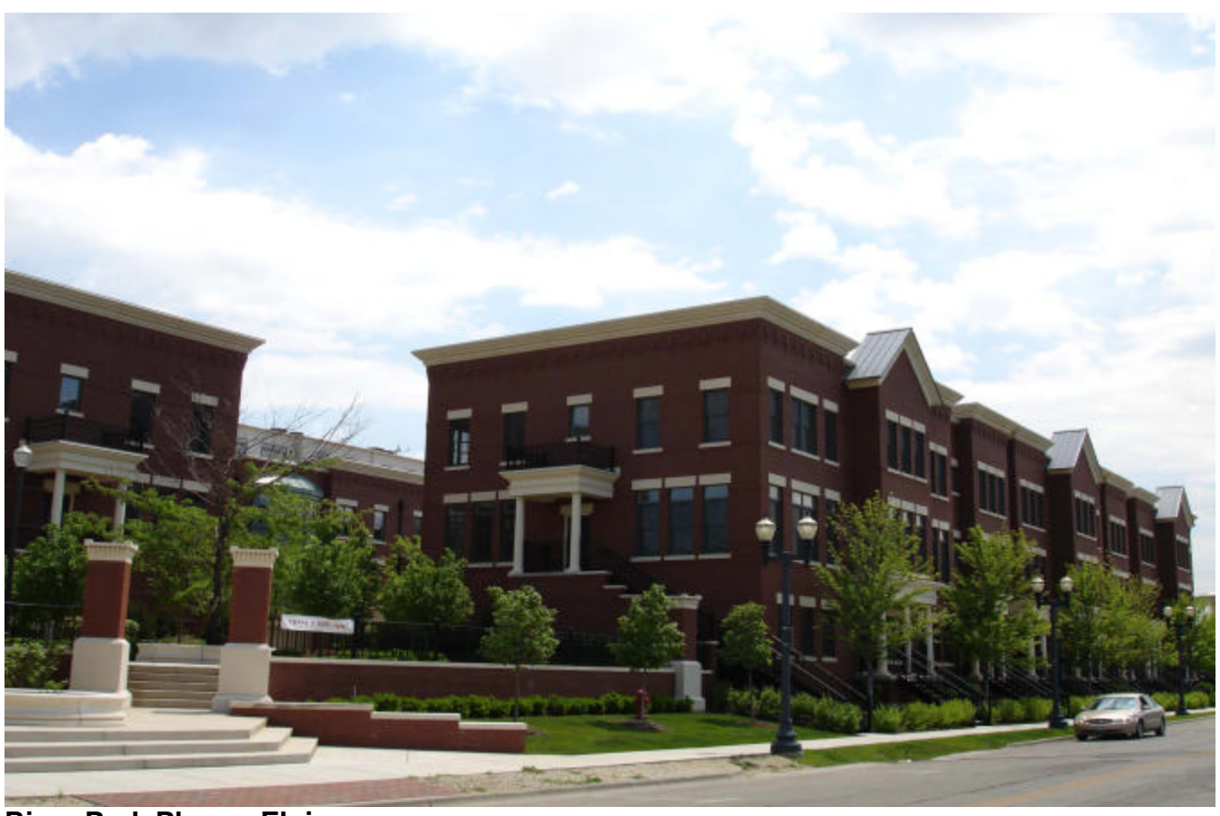
River Park Place - Elgin