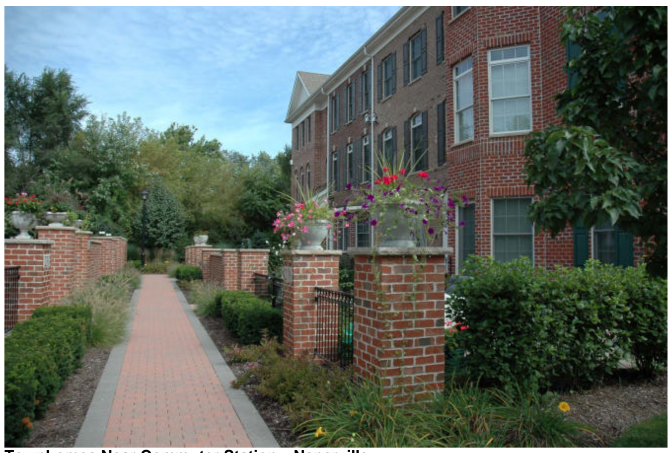
Townhomes Near Commuter Station – Naperville