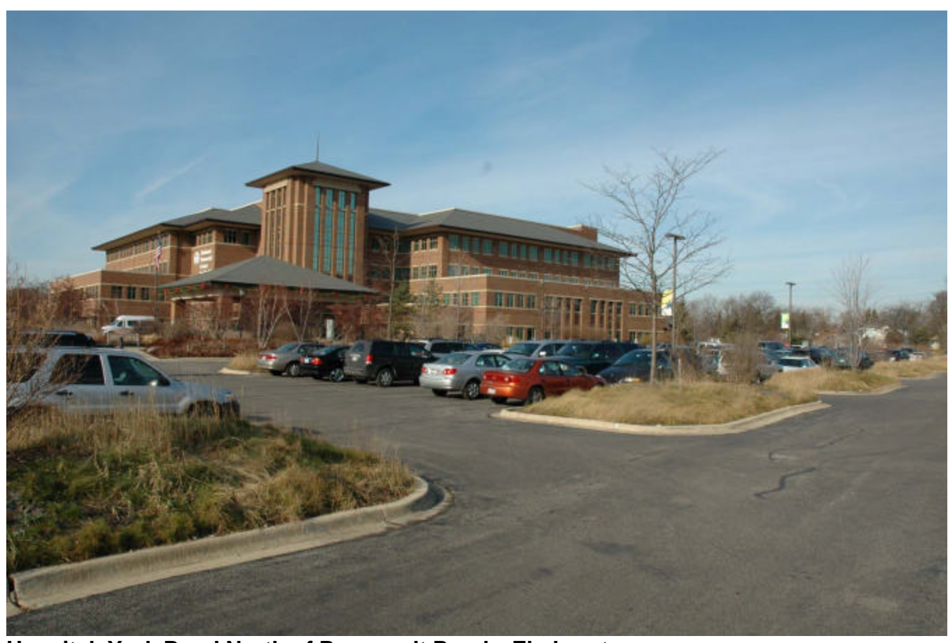
Hospital, York Road North of Roosevelt Road – Elmhurst