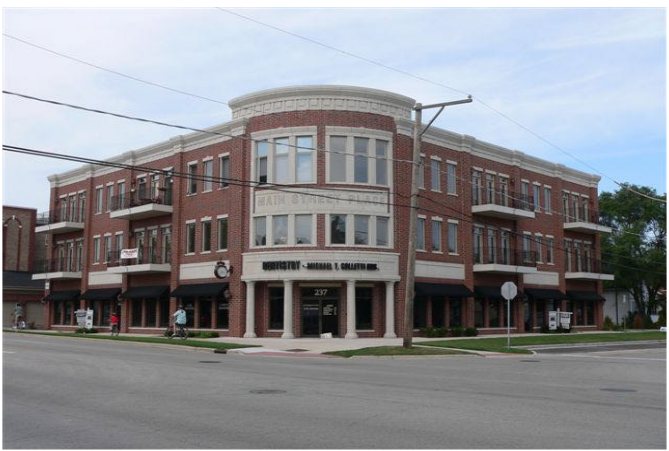
Mixed Use Commercial and Condominiums- Lombard