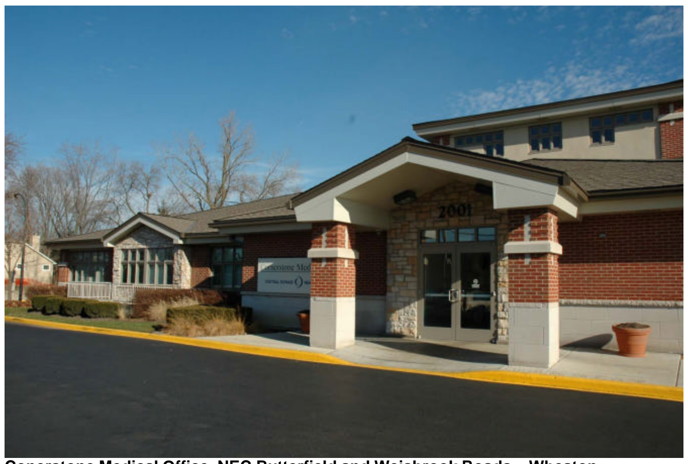
Conerstone Medical Office, NEC Butterfield and Weisbrook Roads – Wheaton