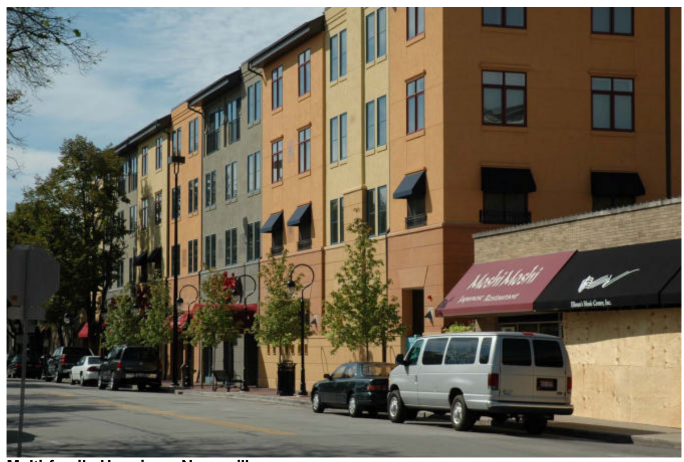
Multi-family Housing – Naperville