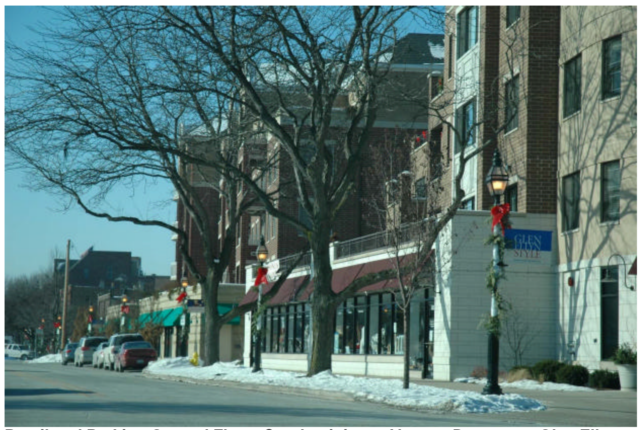
Retail and Parking Ground Floor, Condominiums Above – Downtown Glen Ellyn