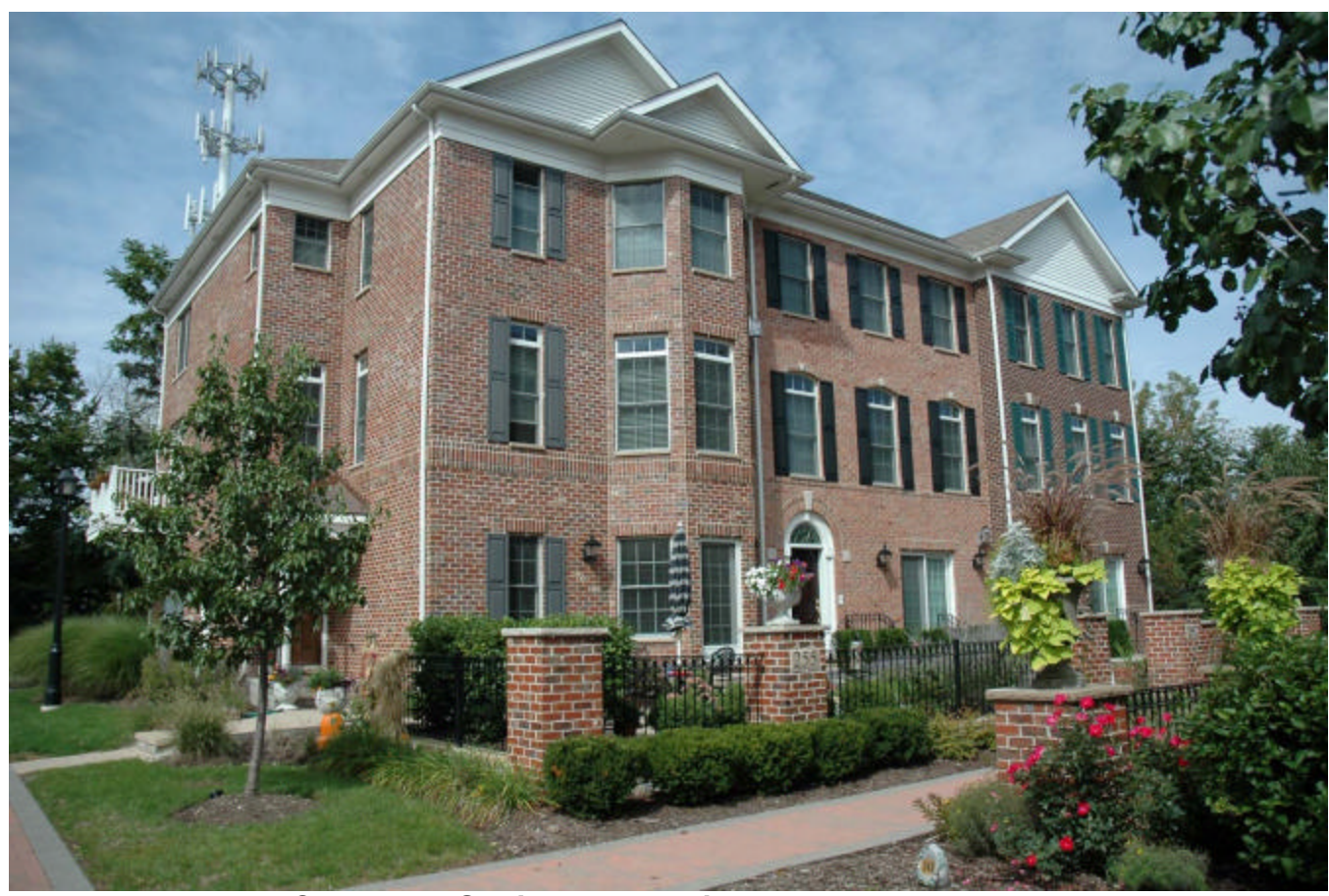
Town Homes Near Commuter Station – Naperville