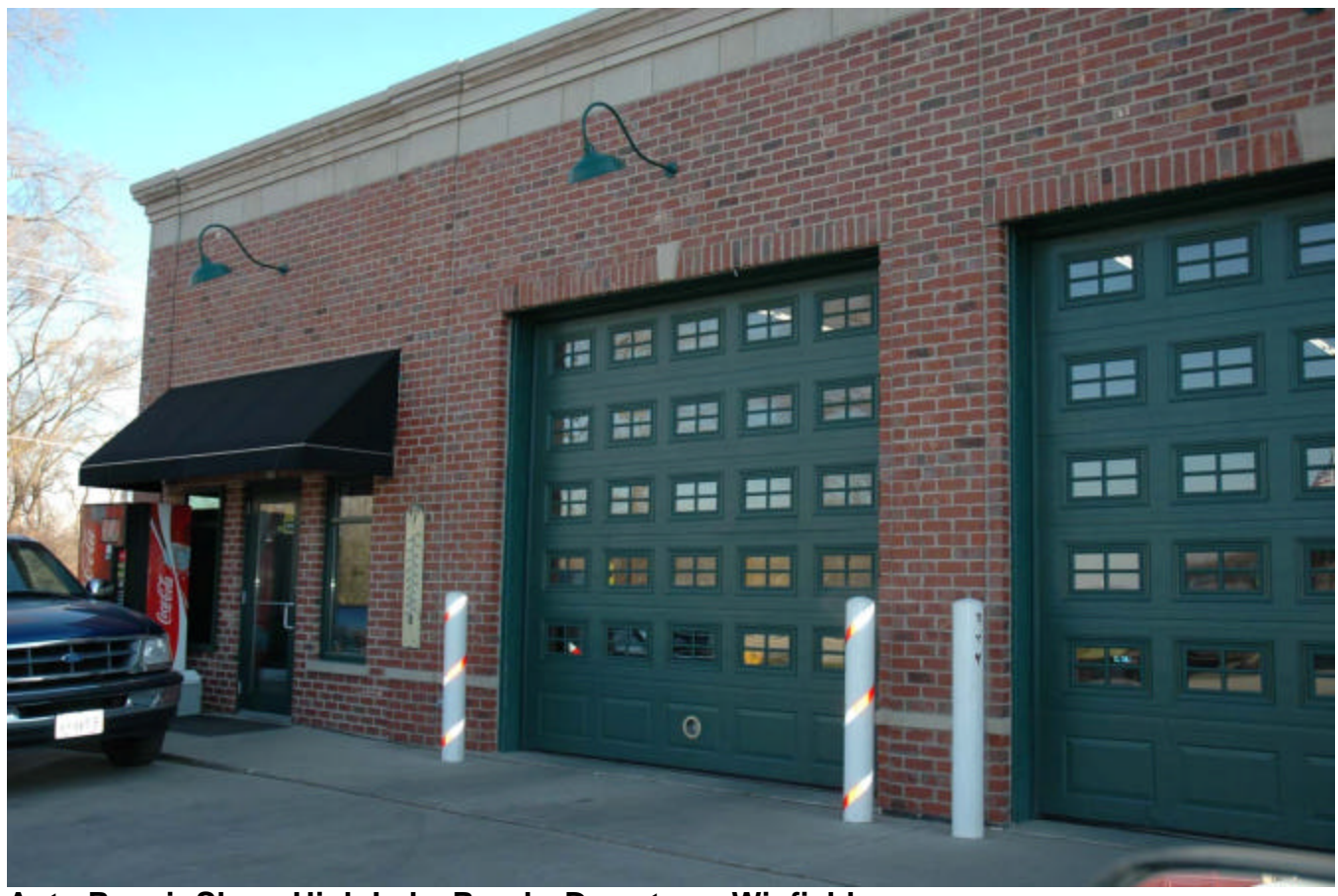
Auto Repair Shop, High Lake Road – Downtown Winfield