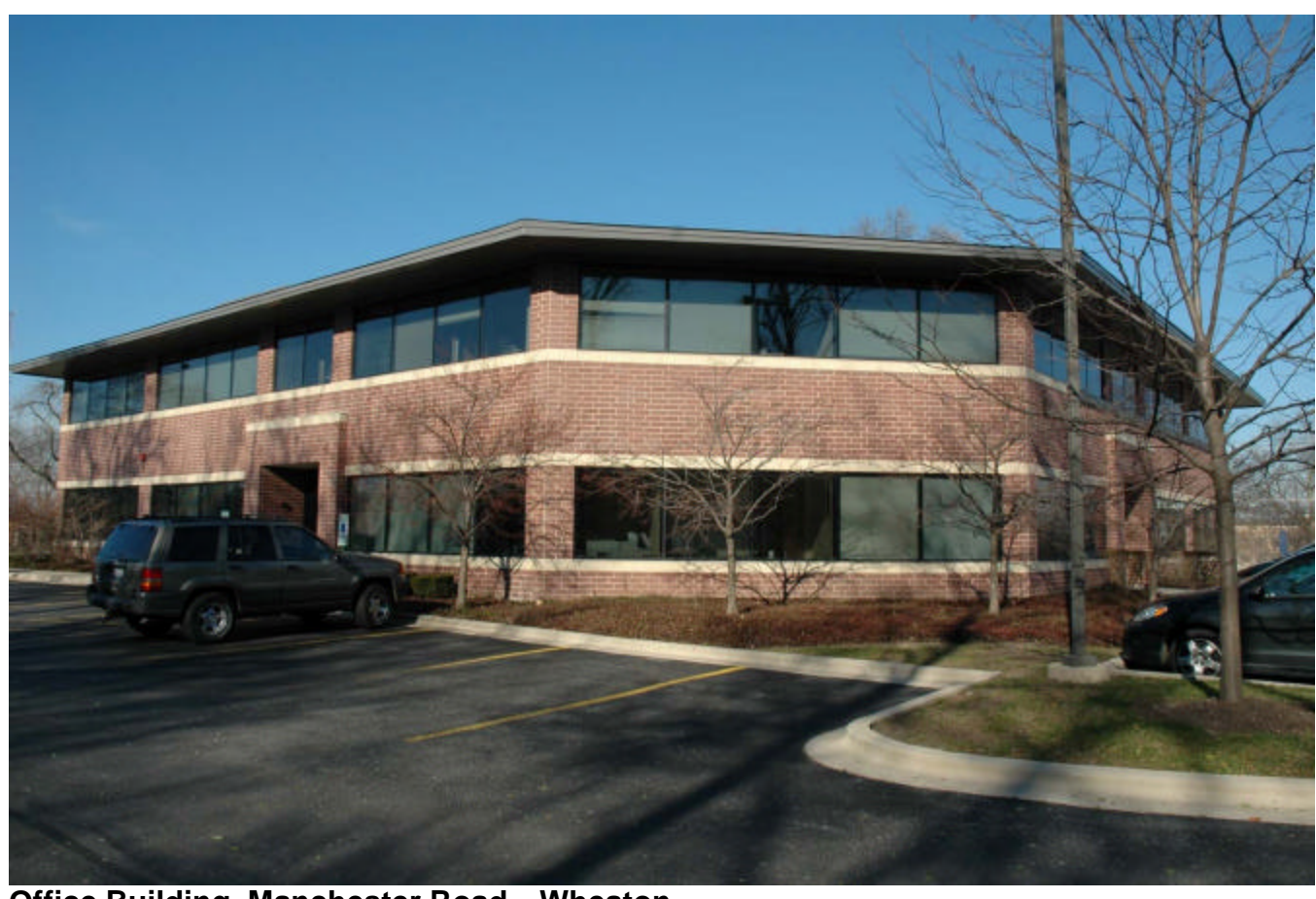
Office Building, Manchester Road – Wheaton