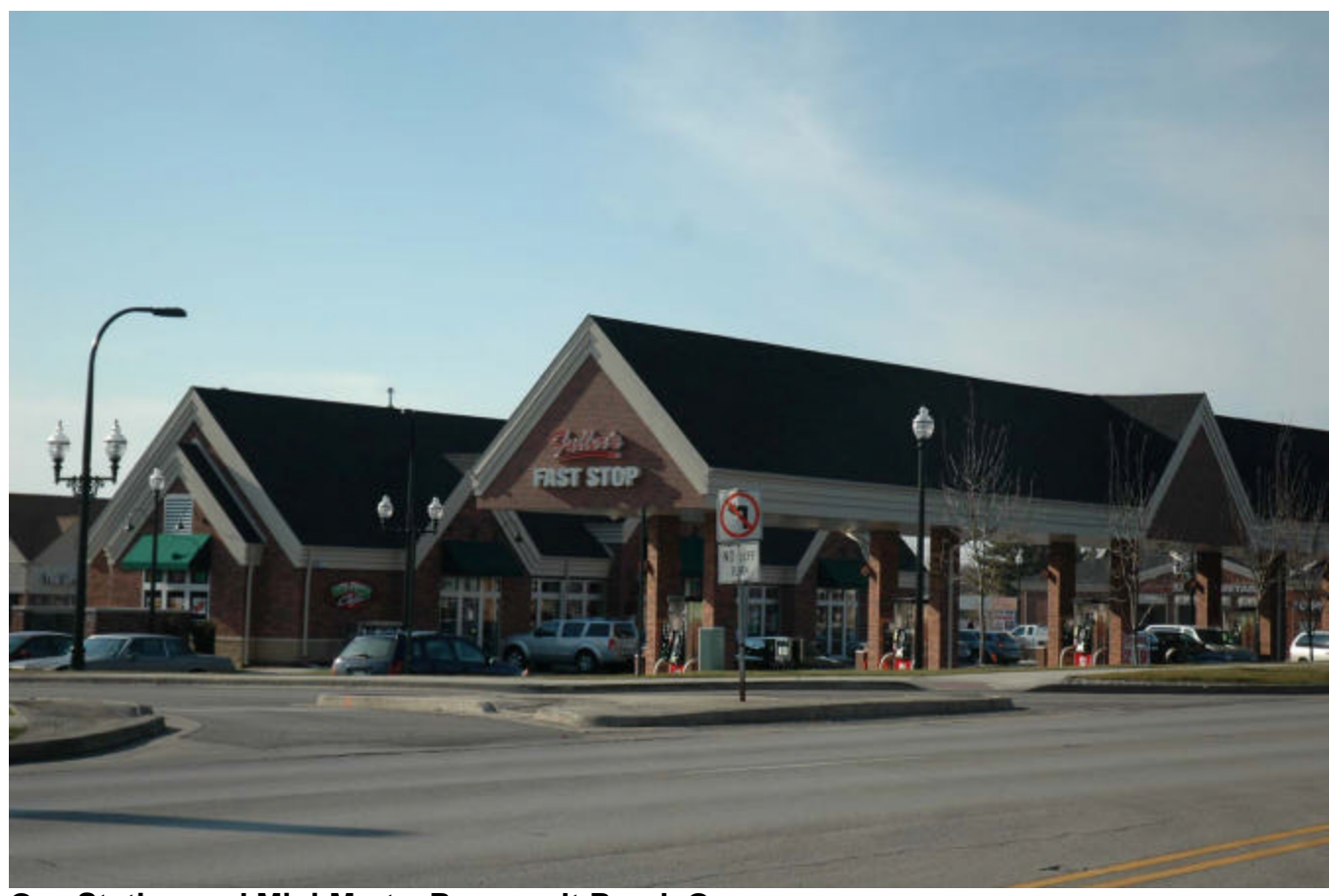
Gas Station and Mini-Mart - Roosevelt Road, Geneva