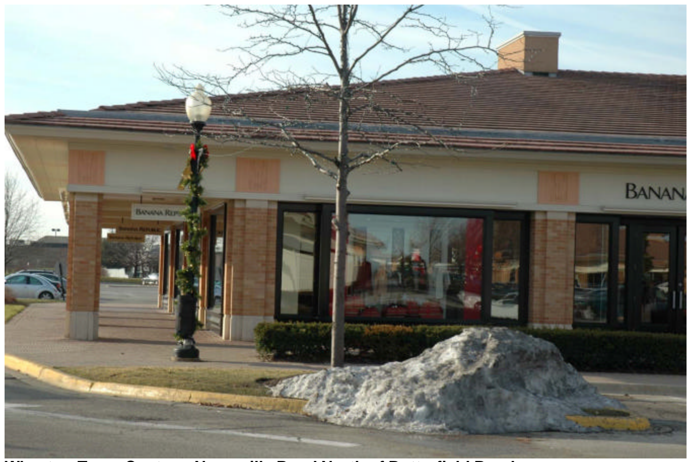
Wheaton Town Center – Naperville Road North of Butterfield Road