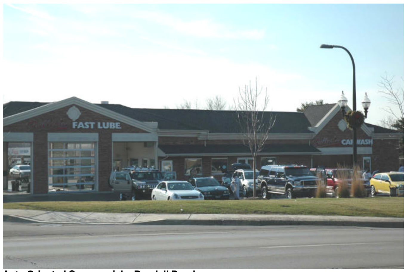
Auto Oriented Commercial – Randall Road