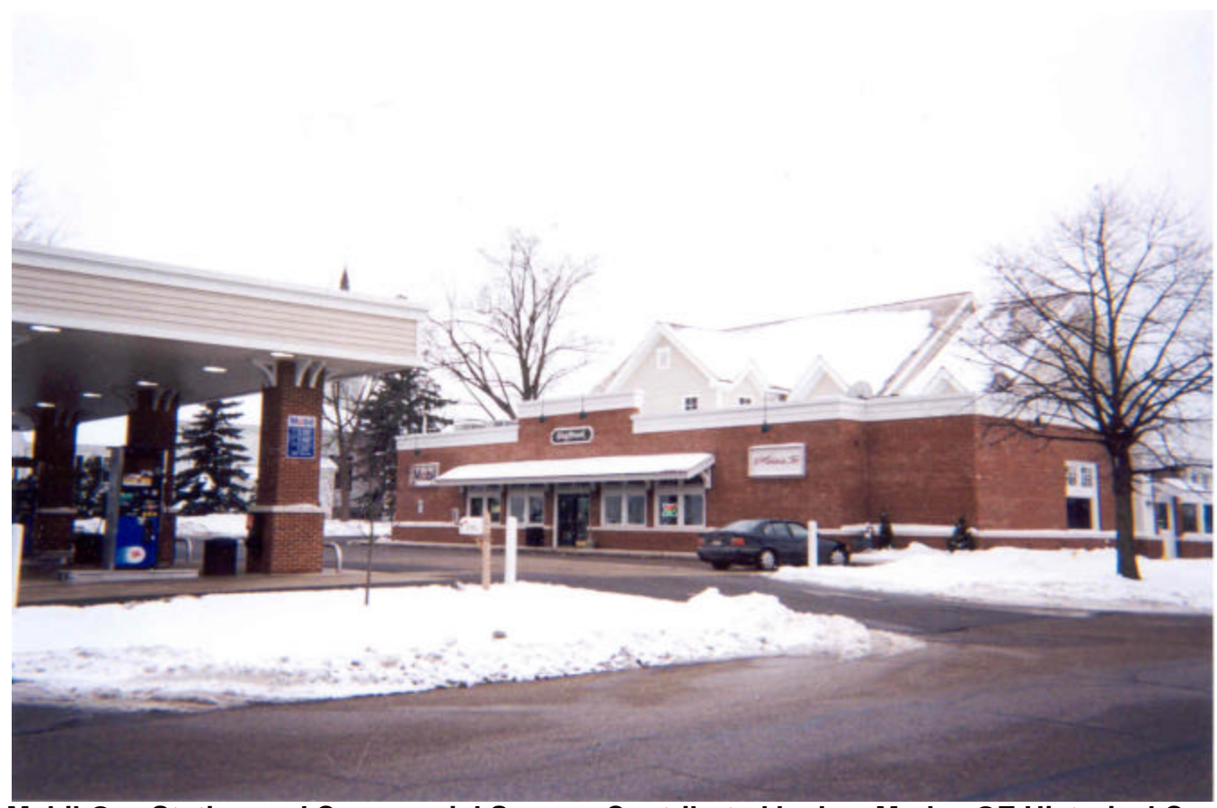
Mobil Gas Station and Commercial Space