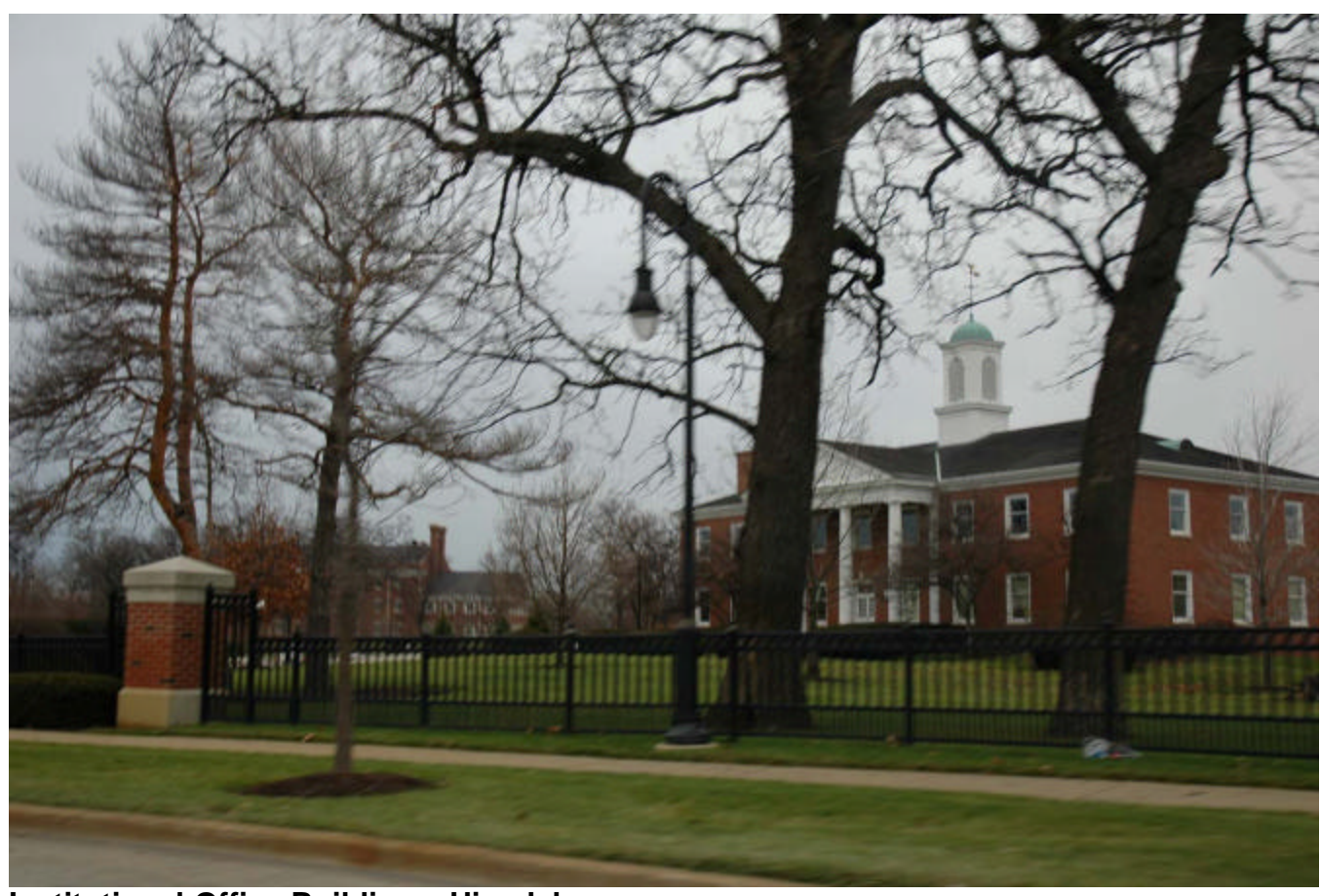
Institutional Office Building – Hinsdale