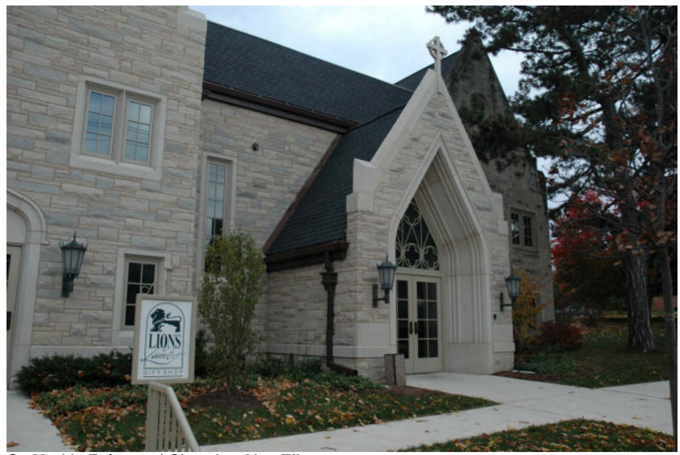
St. Mark's Episcopal Church – Glen Ellyn