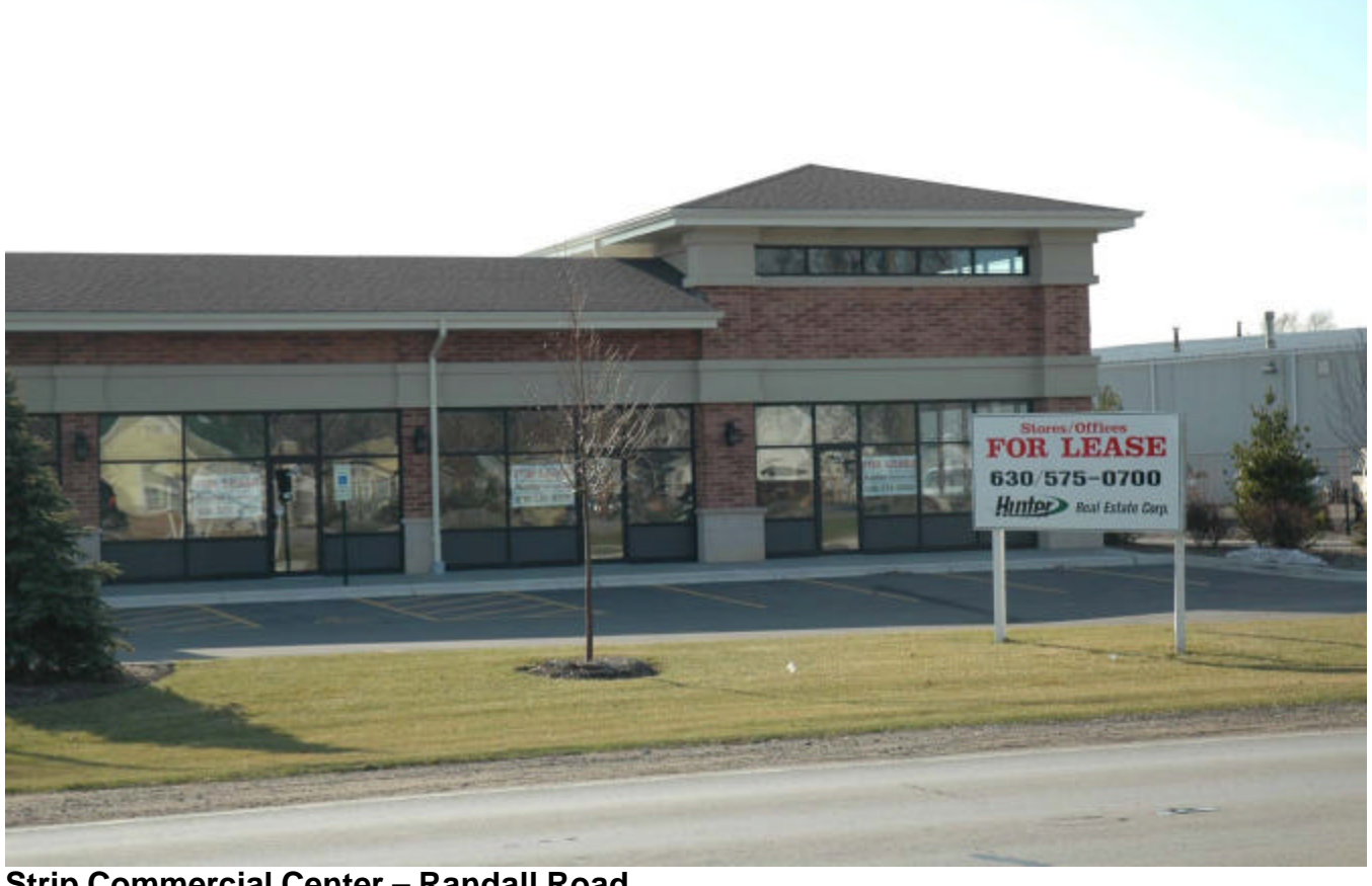
Strip Commercial Center – Randall Road