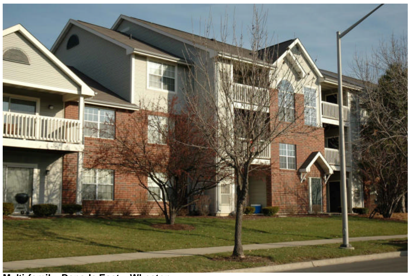
Multi-family, Danada East – Wheaton