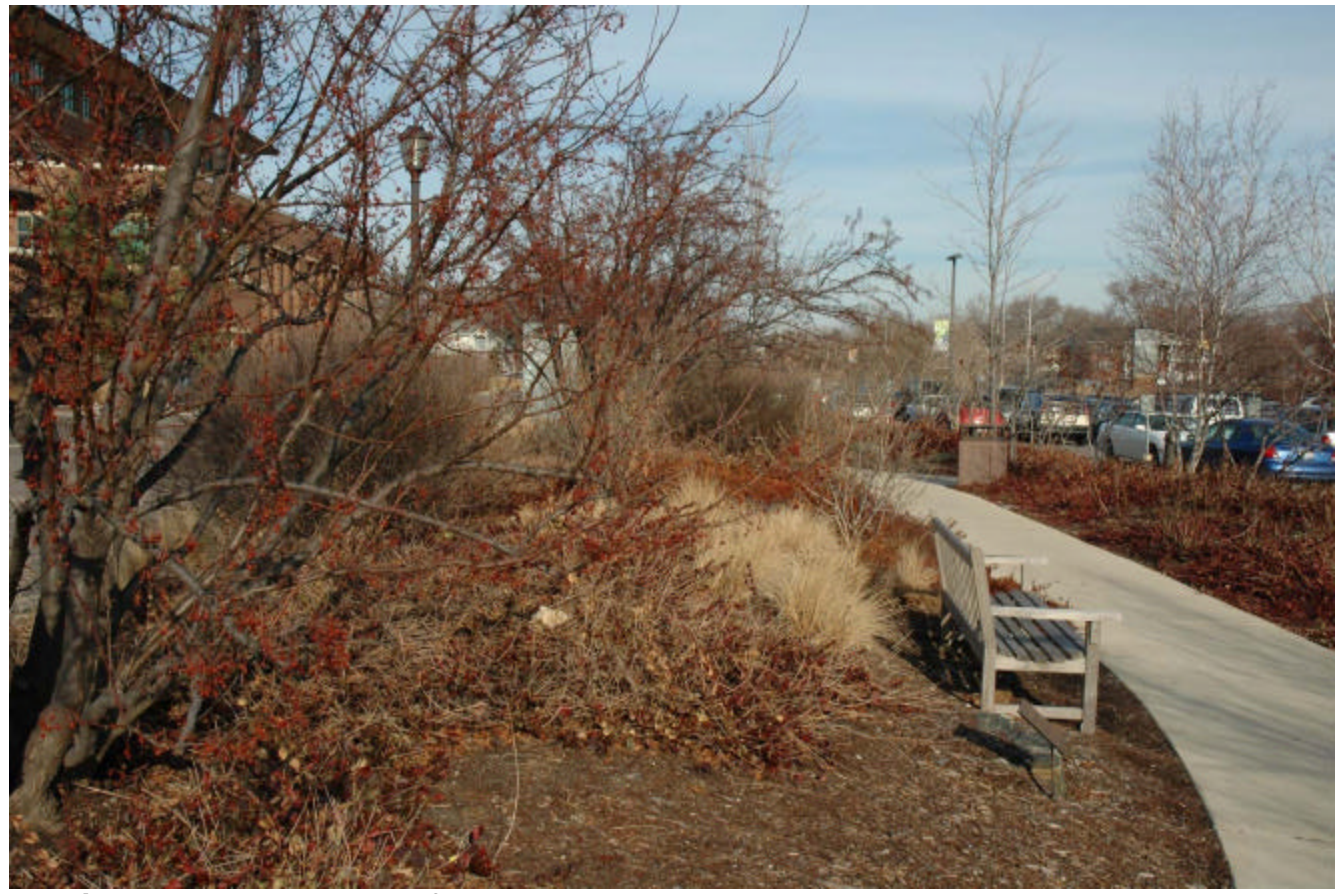
Hospital, York Road North of Roosevelt Road – Elmhurst