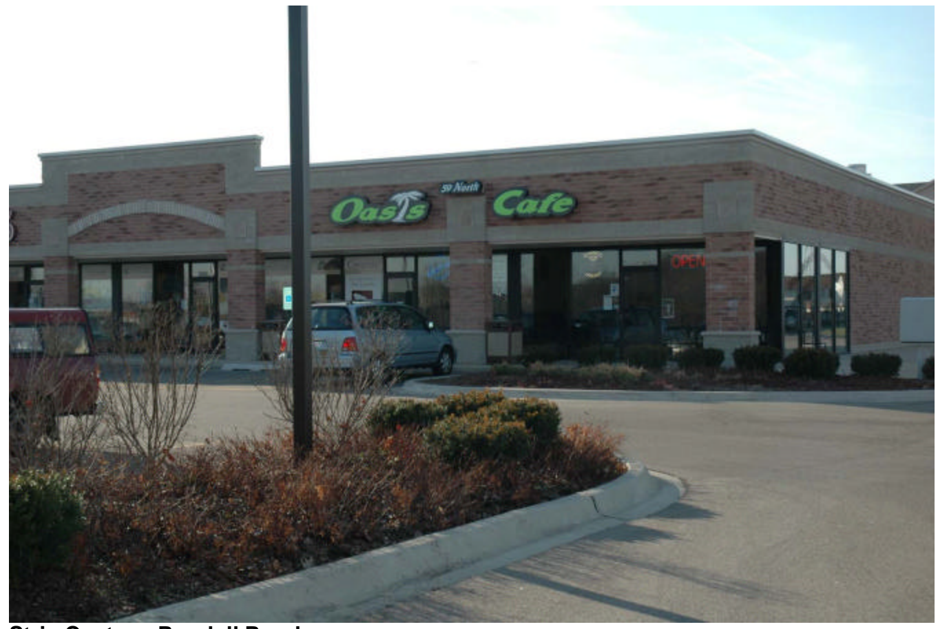
Strip Center – Randall Road