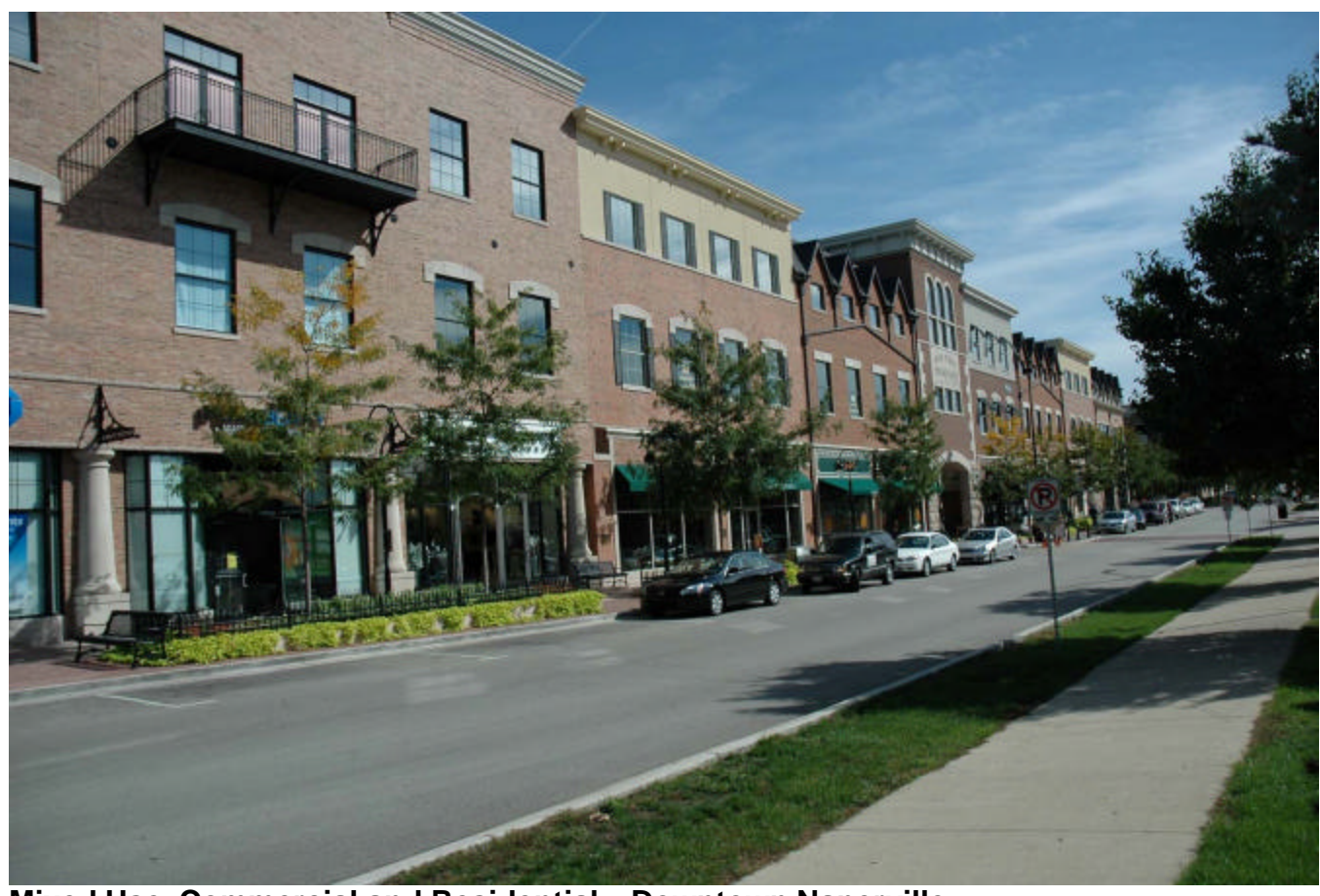
Mixed Use, Commercial and Residential – Downtown Naperville