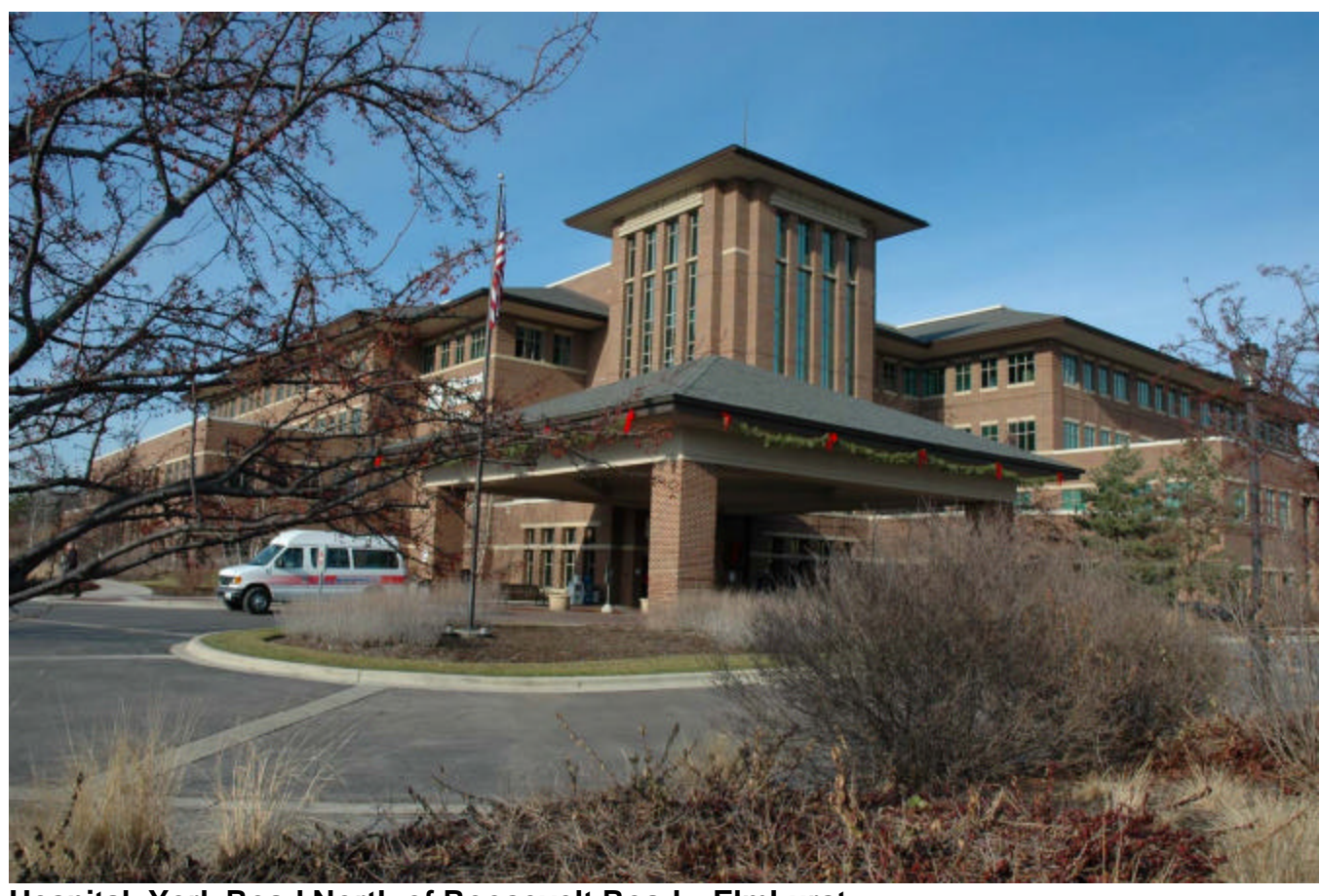
Hospital, York Road North of Roosevelt Road – Elmhurst