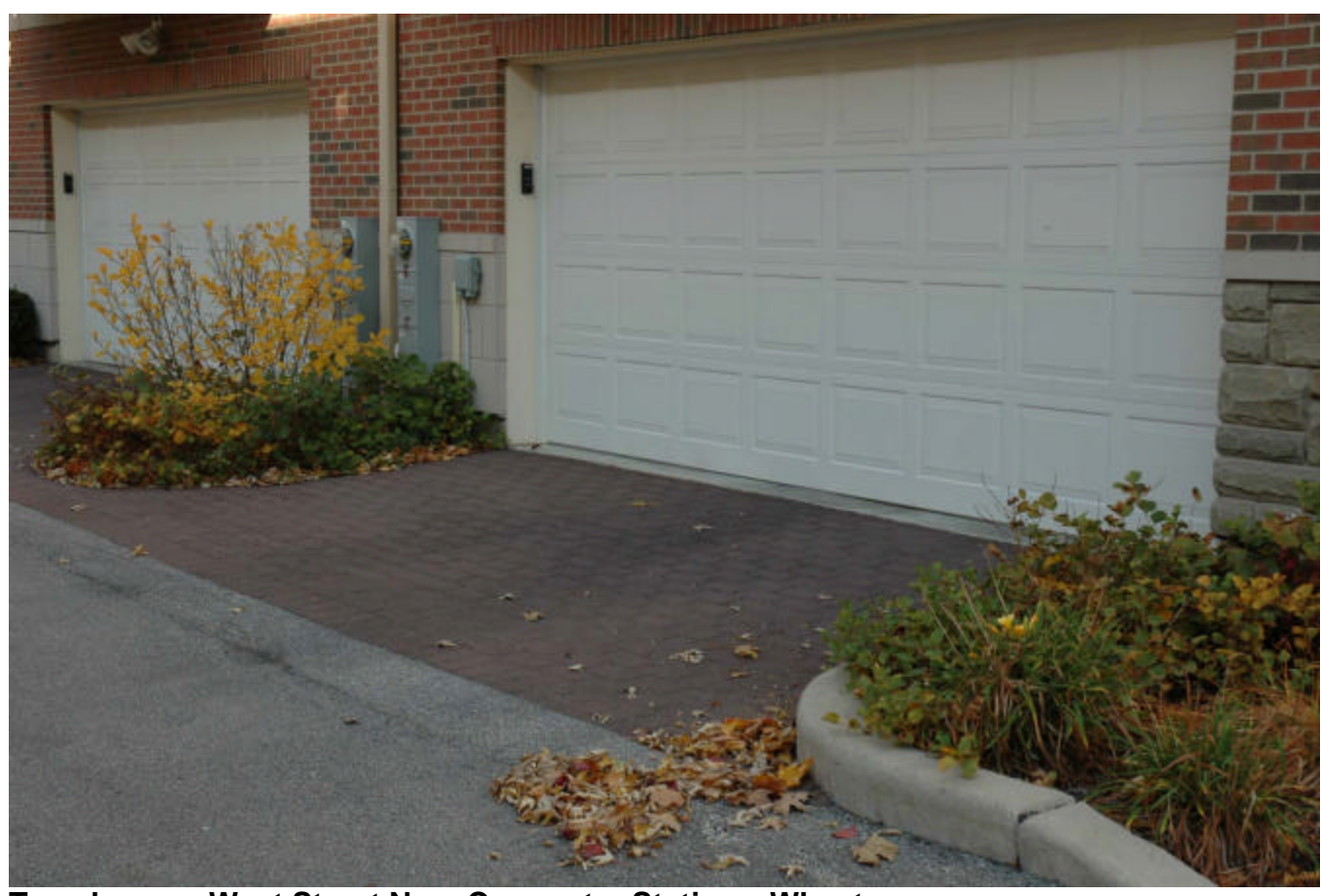
Townhomes, West Street Near Commuter Station – Wheaton