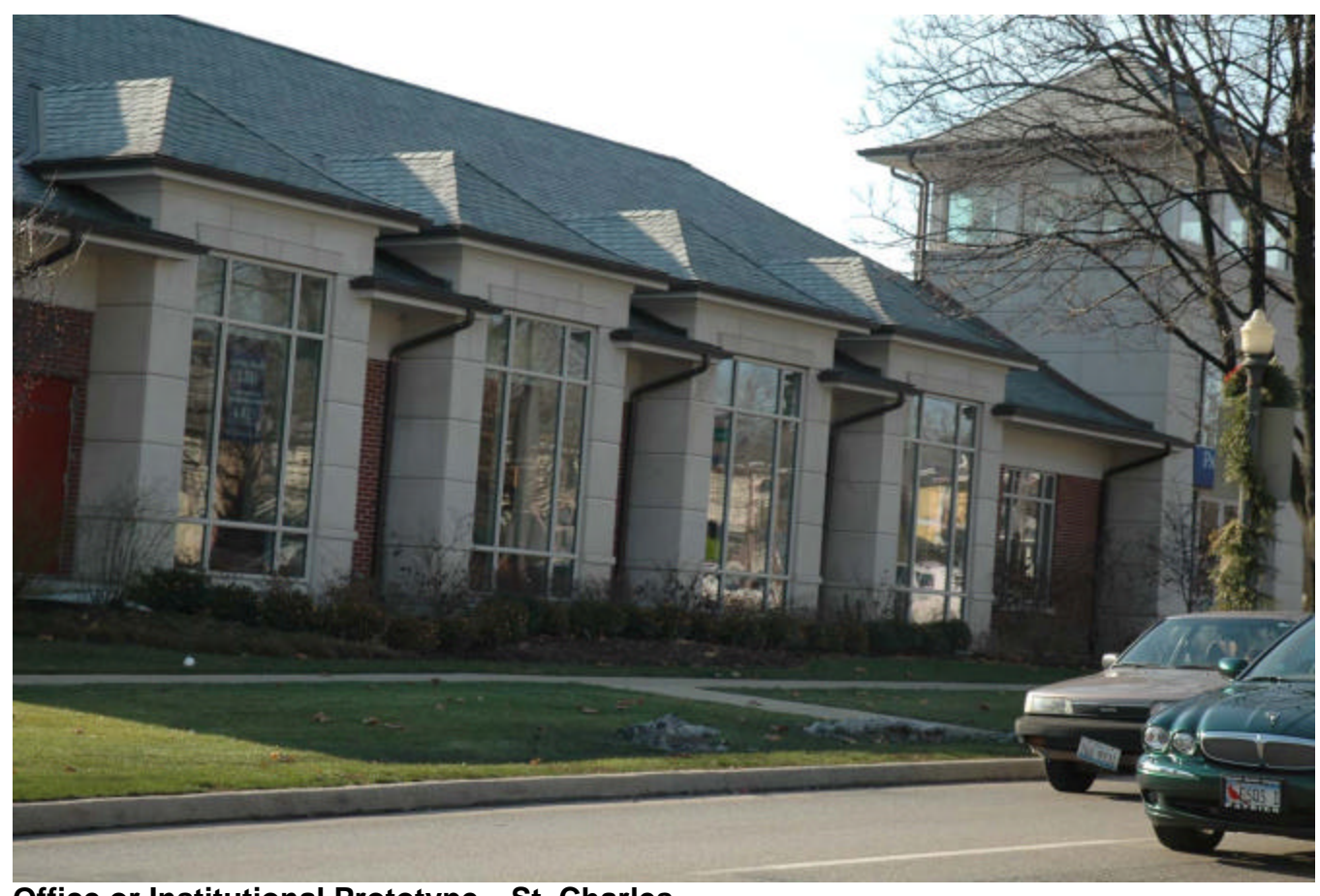
Office or Institutional Prototype – St. Charles