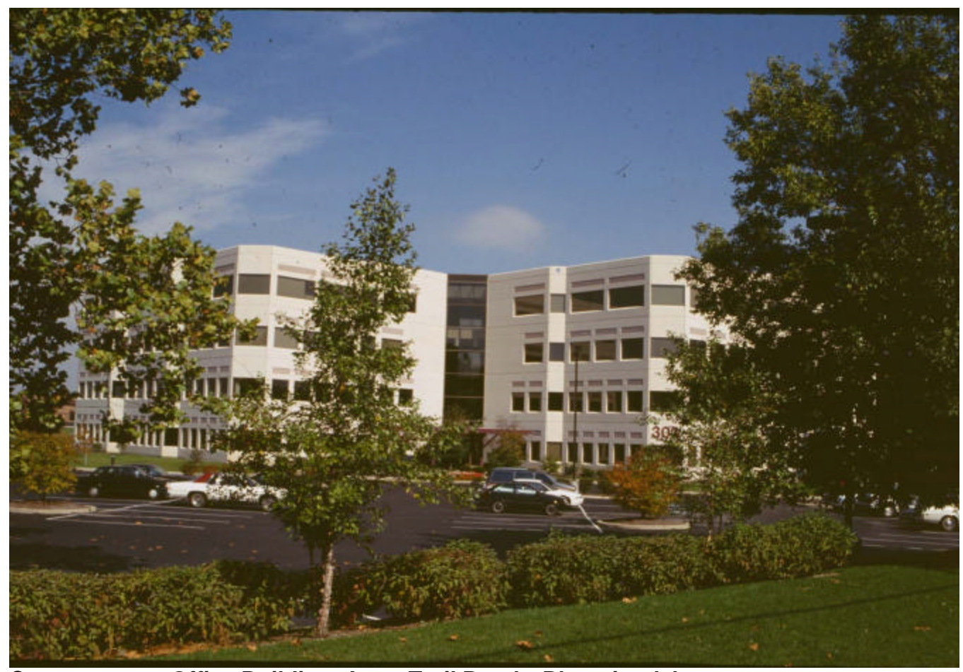
Contemporary Office Building, Army Trail Road – Bloomingdale