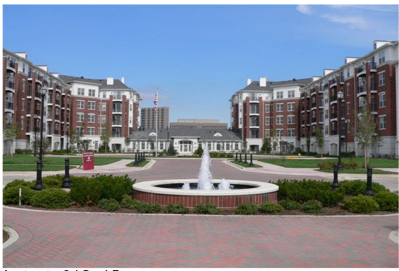
Apartments- Oak Brook Terrace