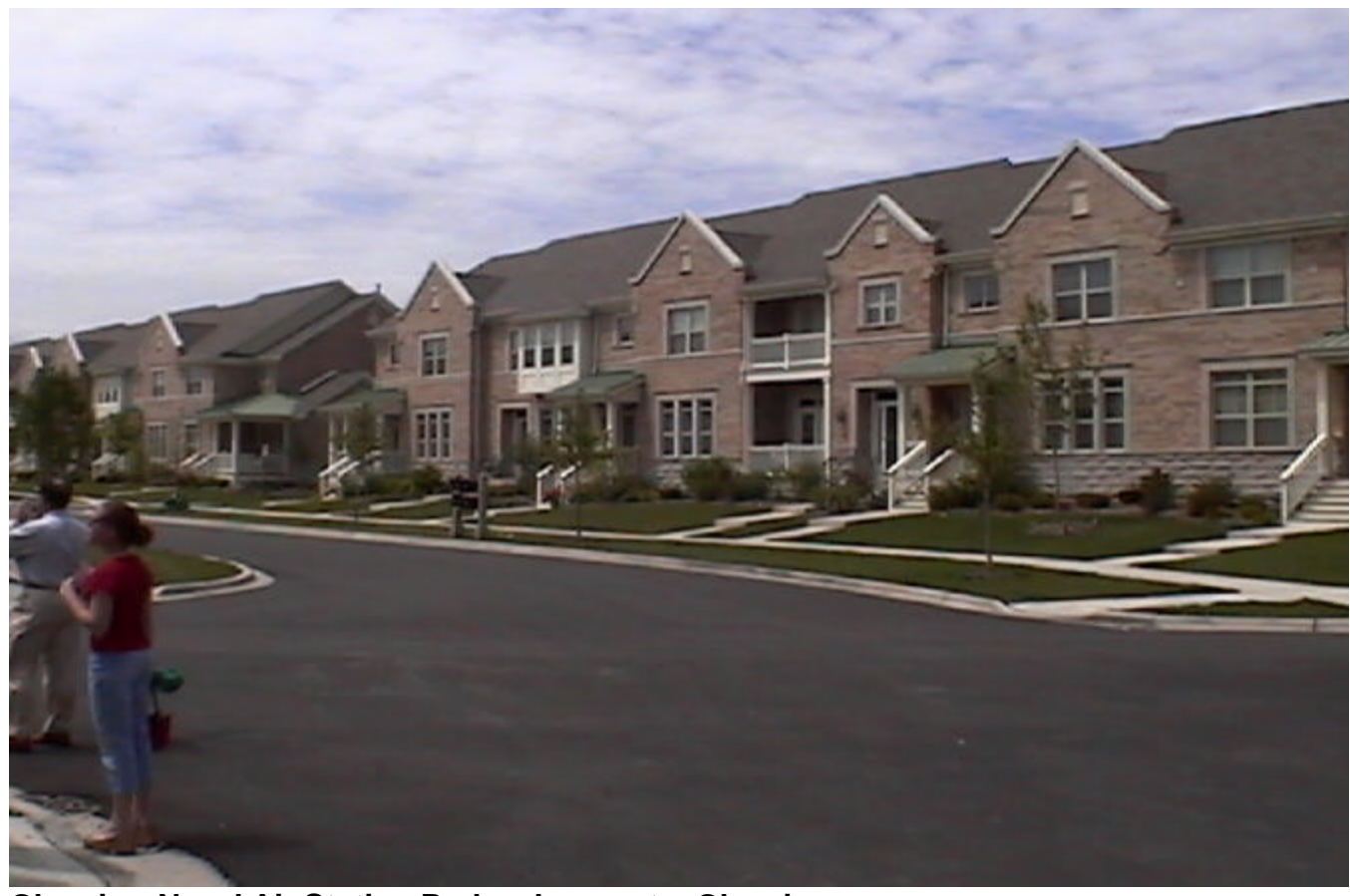
Glenview Naval Air Station Redevelopment – Glenview