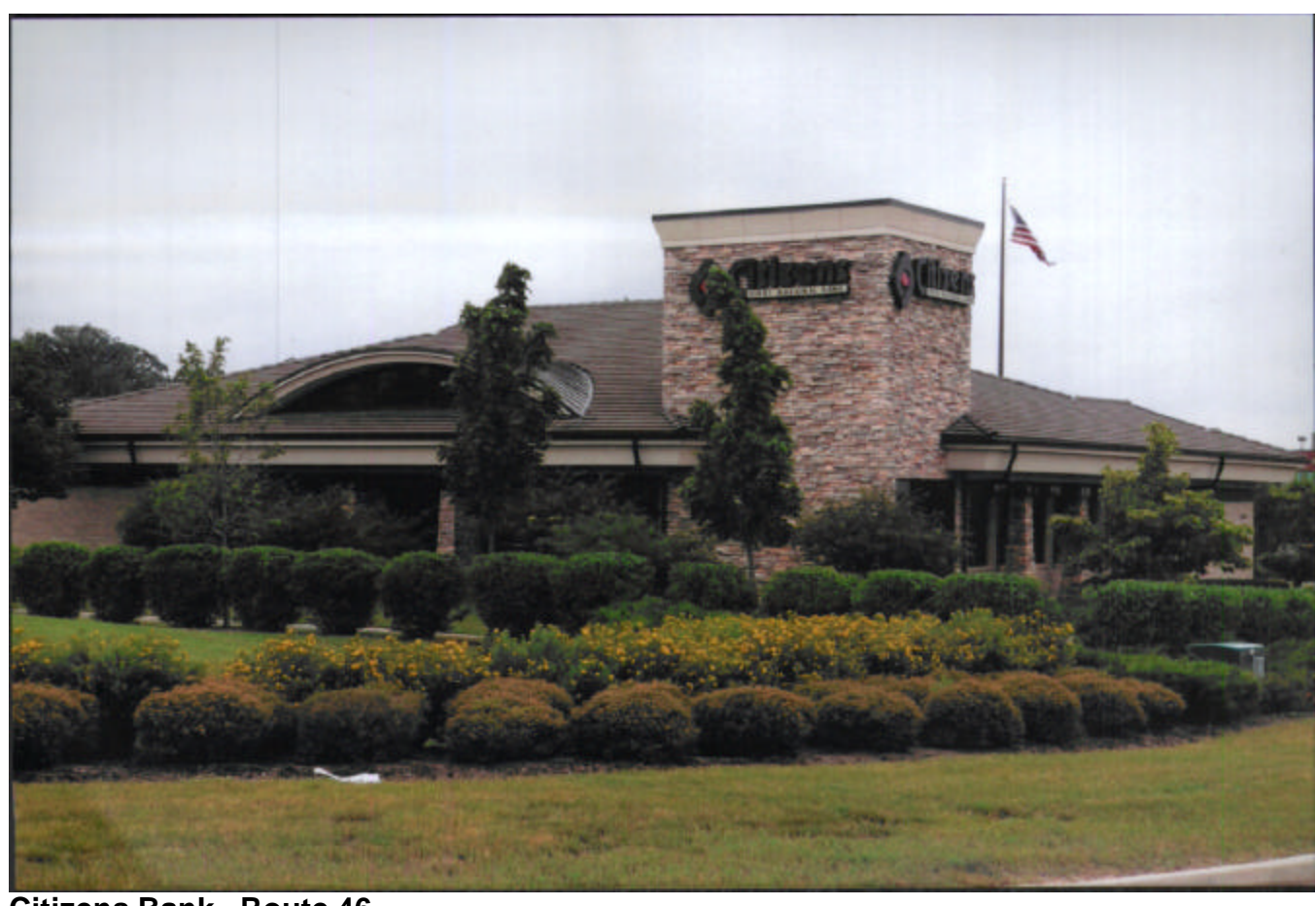
Citizens Bank- Route 46