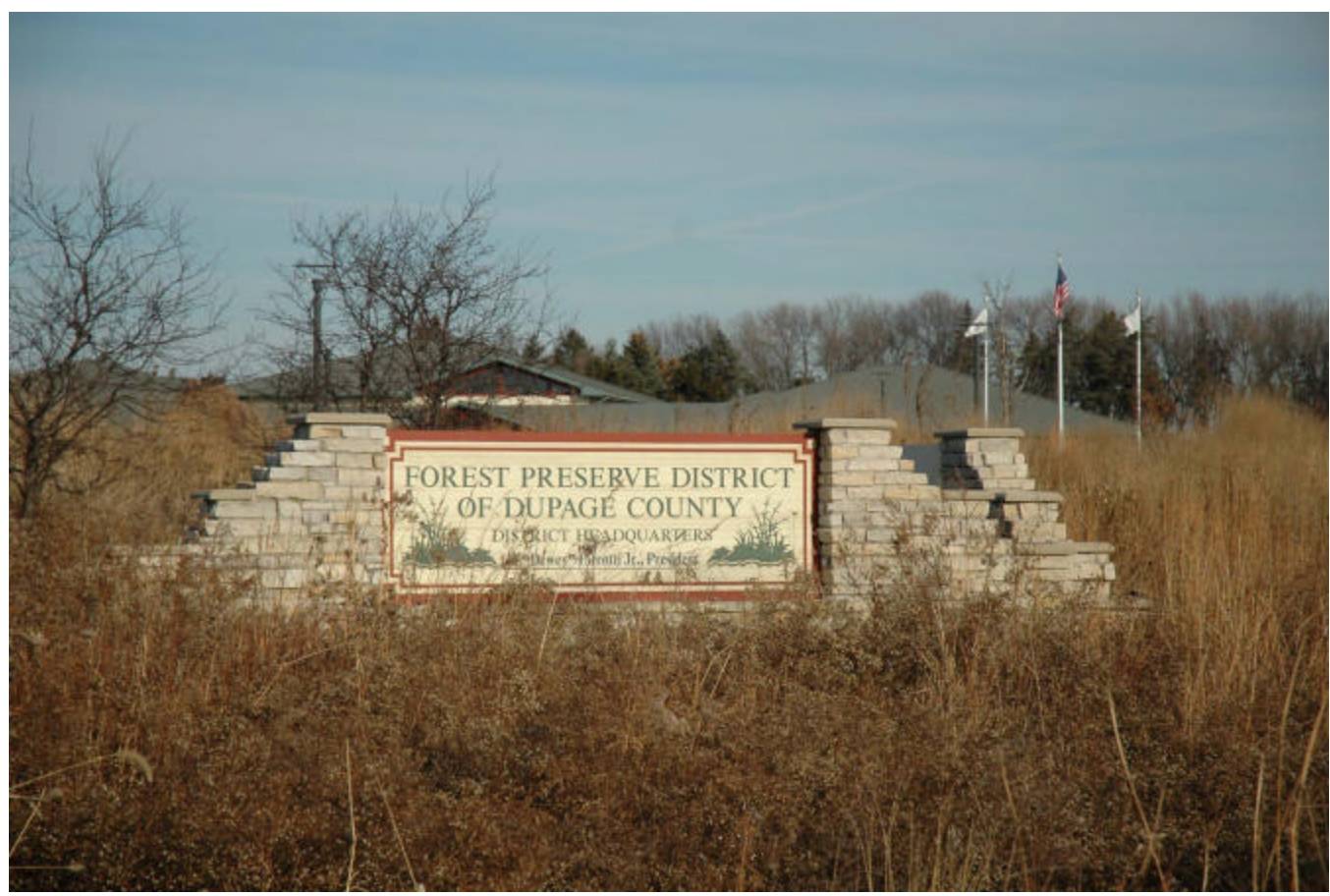
Forest Preserve Headquarters, Naperville Road – Wheaton