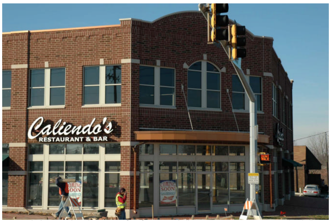
New Building on Historic Theme, SW Corner, Winfield Road and Jewell Road? Winfield