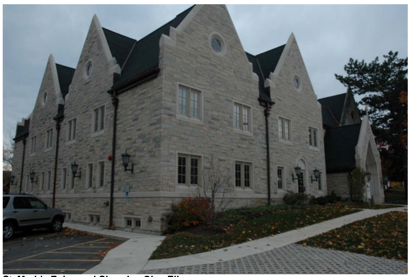
St. Mark's Episcopal Church – Glen Ellyn