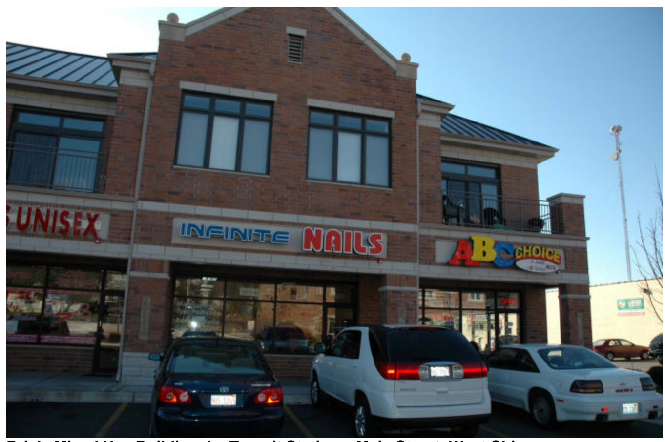
Brick, Mixed Use Building, by Transit Station – Main Street, West Chicago