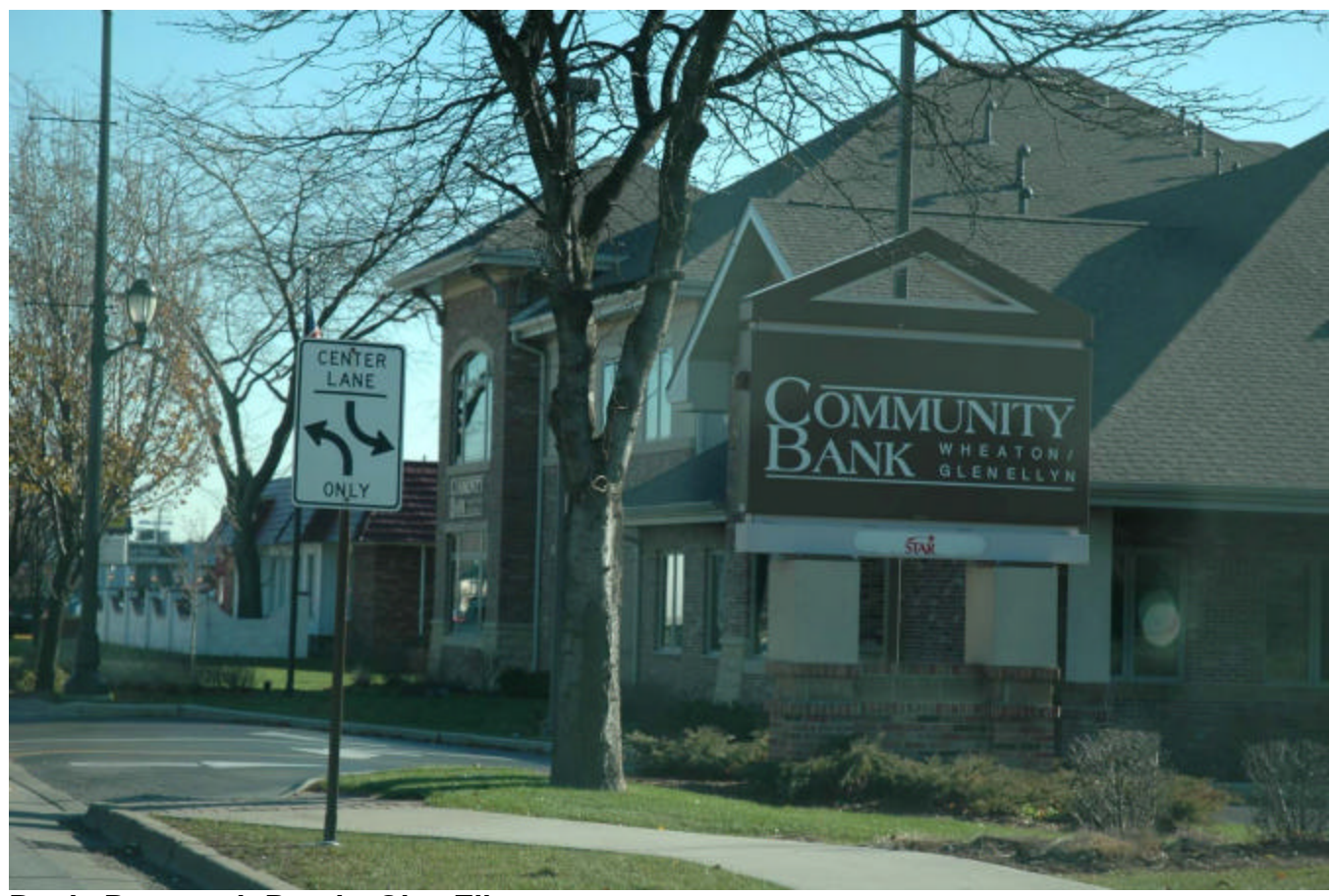
Bank, Roosevelt Road - Glen Ellyn