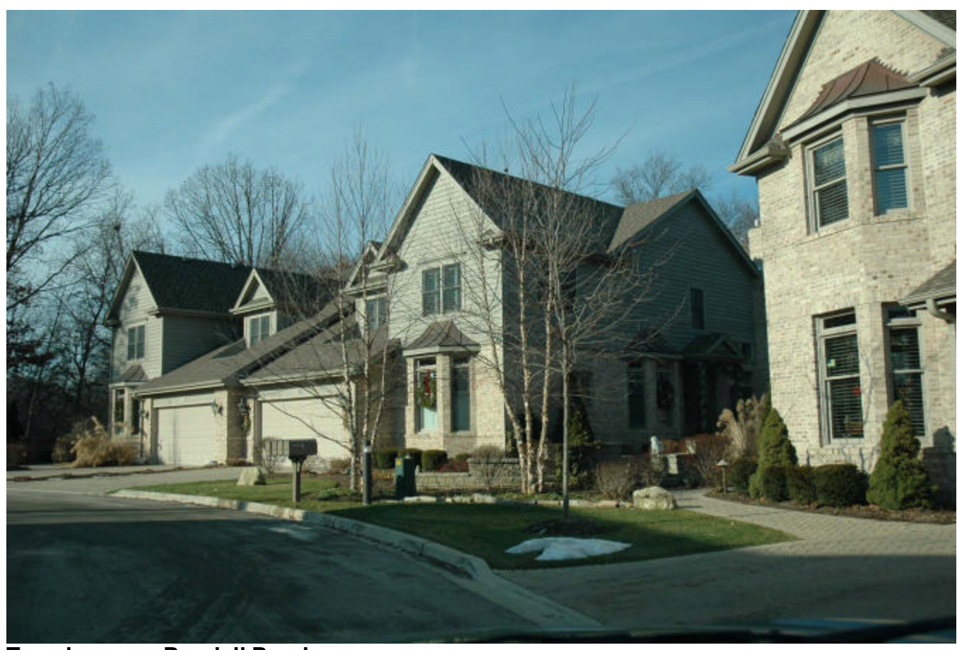
Townhomes - Randall Road