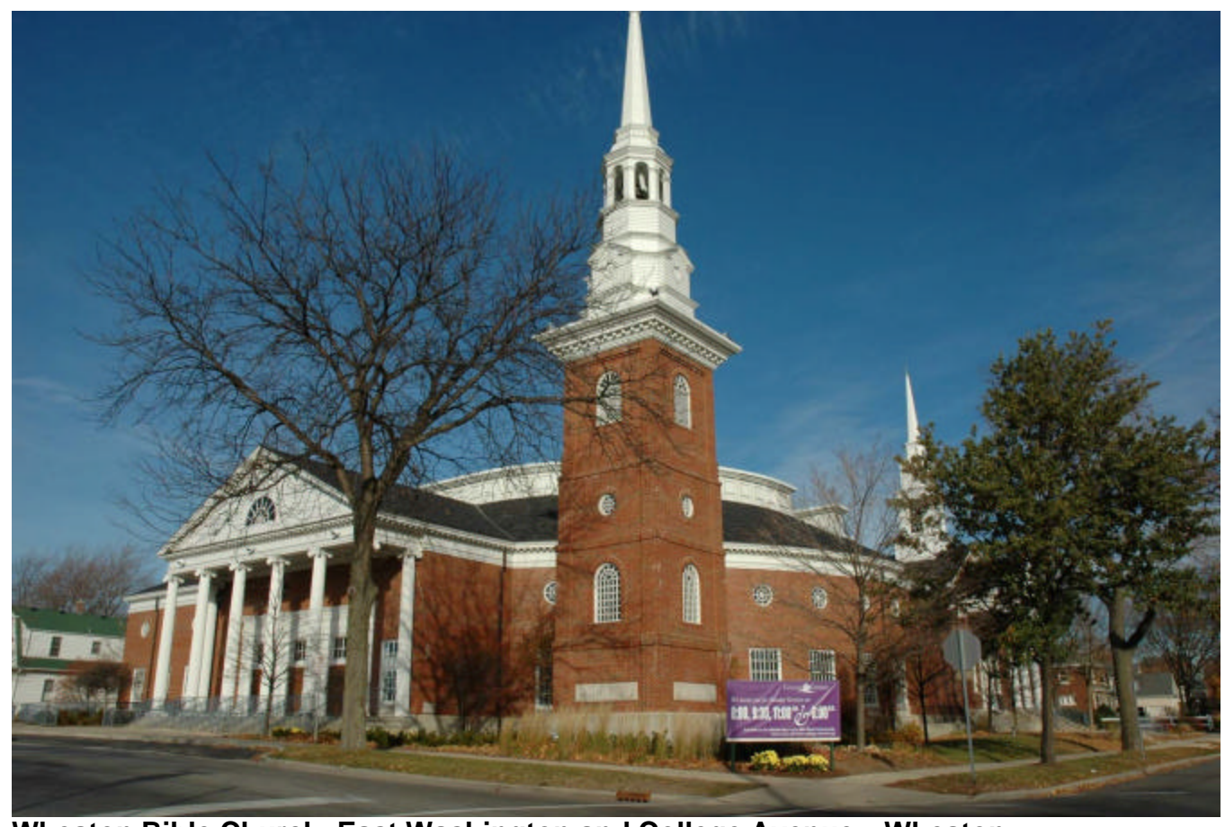
Wheaton Bible Church, East Washington and College Avenue – Wheaton