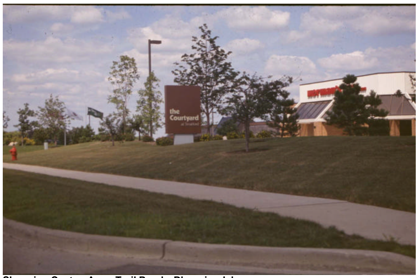
Shopping Center, Army Trail Road – Bloomingdale