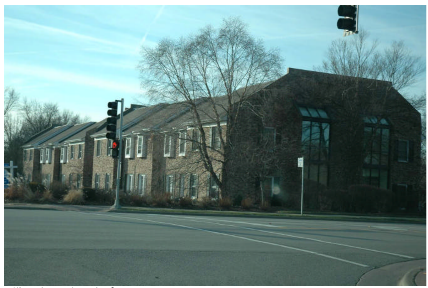
Offices in Residential Style, Roosevelt Road – Wheaton