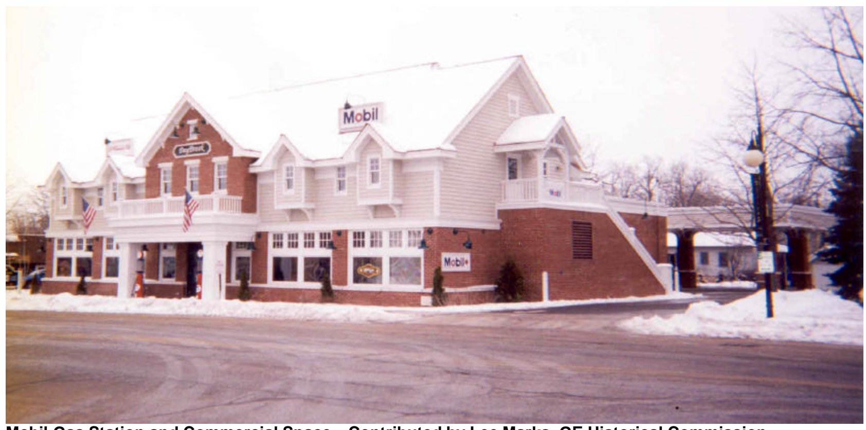
Mobil Gas Station and Commercial Space