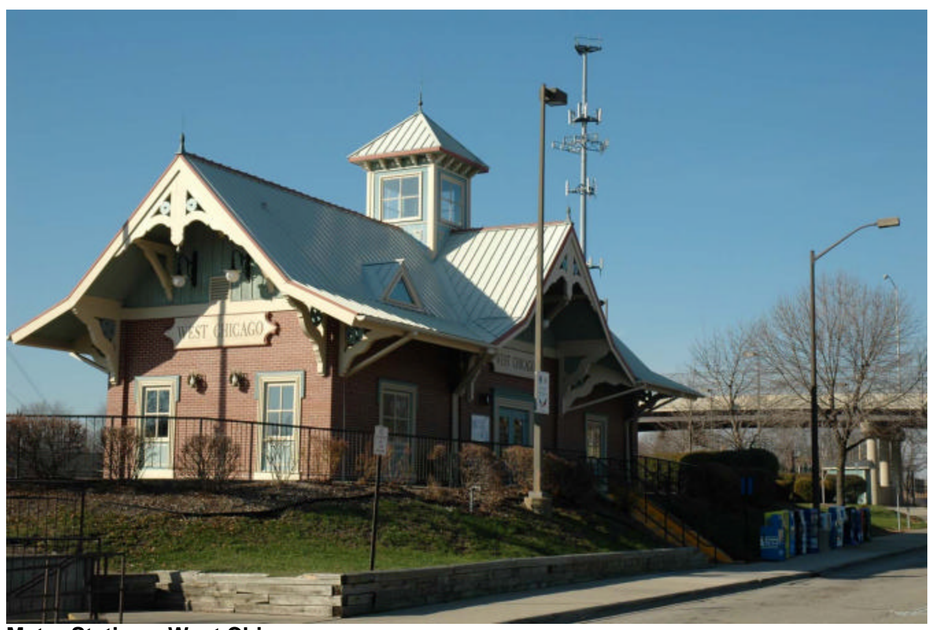
Metra Station – West Chicago