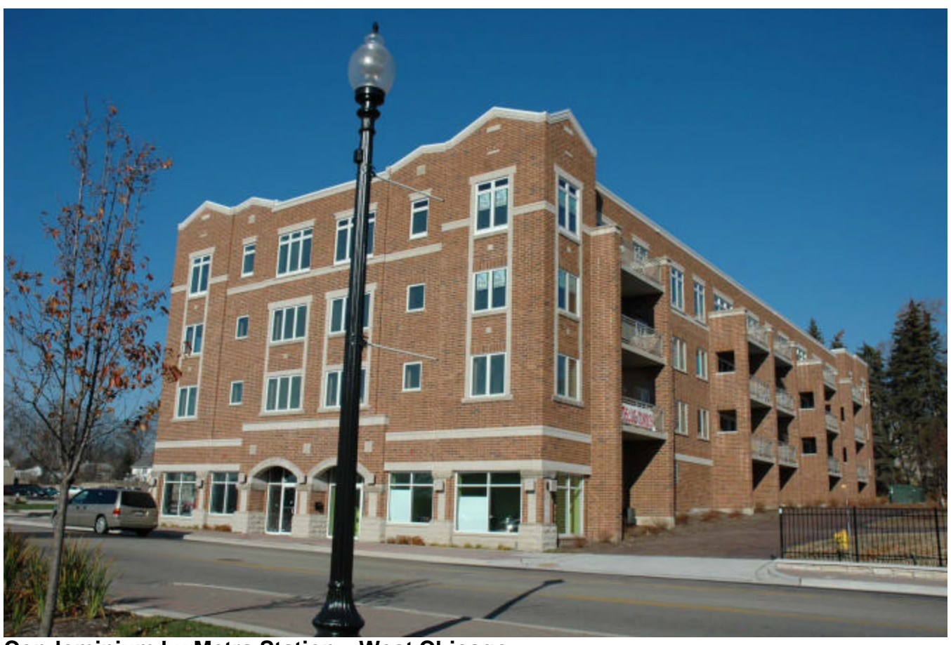
Condominium by Metra Station – West Chicago