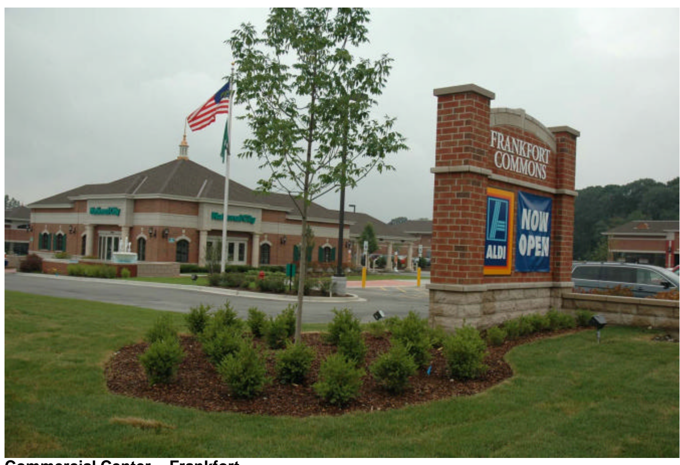
Commercial Center – Frankfort