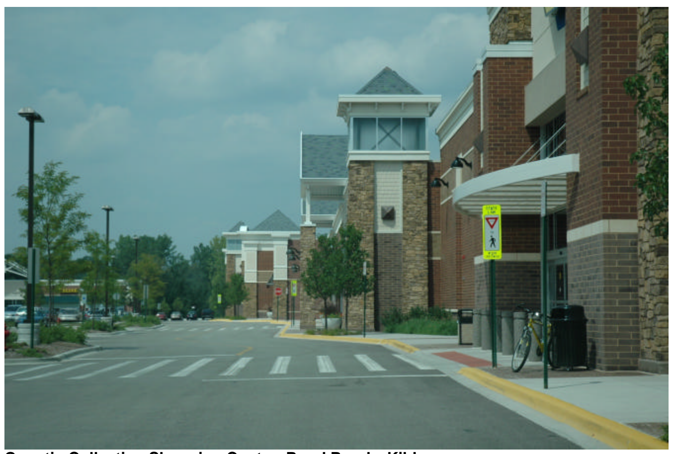
Quentin Collection Shopping Center, Rand Road – Kildeer