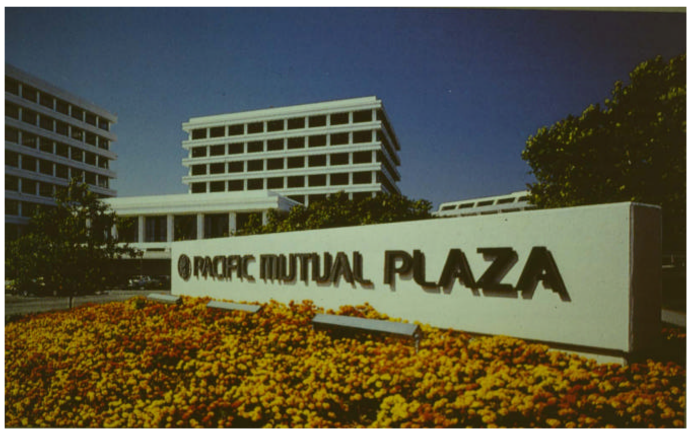
Business Park - Naperville