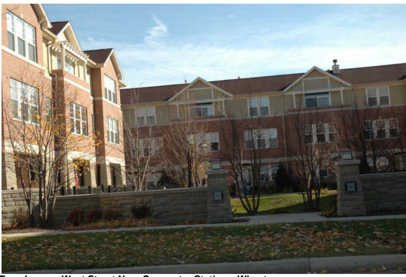
Townhomes, West Street Near Commuter Station – Wheaton