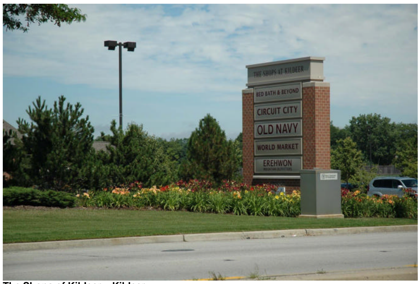
The Shops of Kildeer - Kildeer