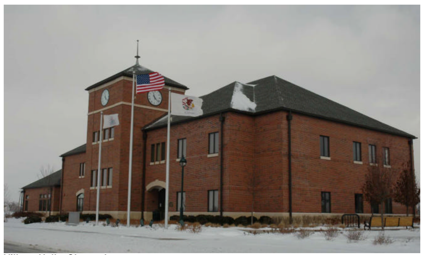
Village Hall – Channahon