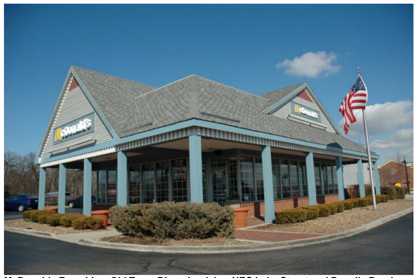
McDonalds Franchise, Old Town Bloomingdale – NEC Lake Street and Roselle Road