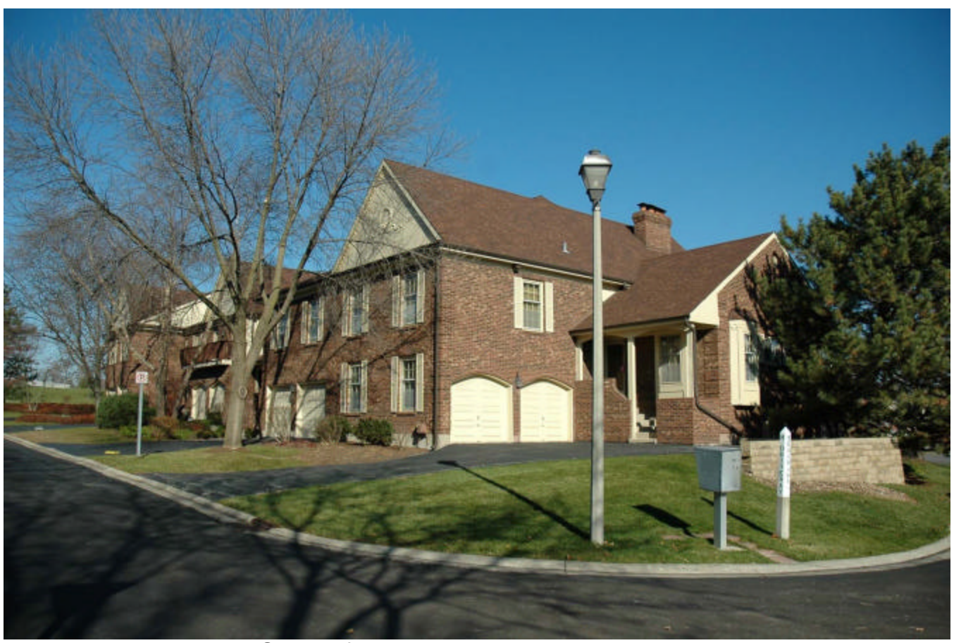
Townhomes, Maryknoll South of Roosevelt Road – Glen Ellyn