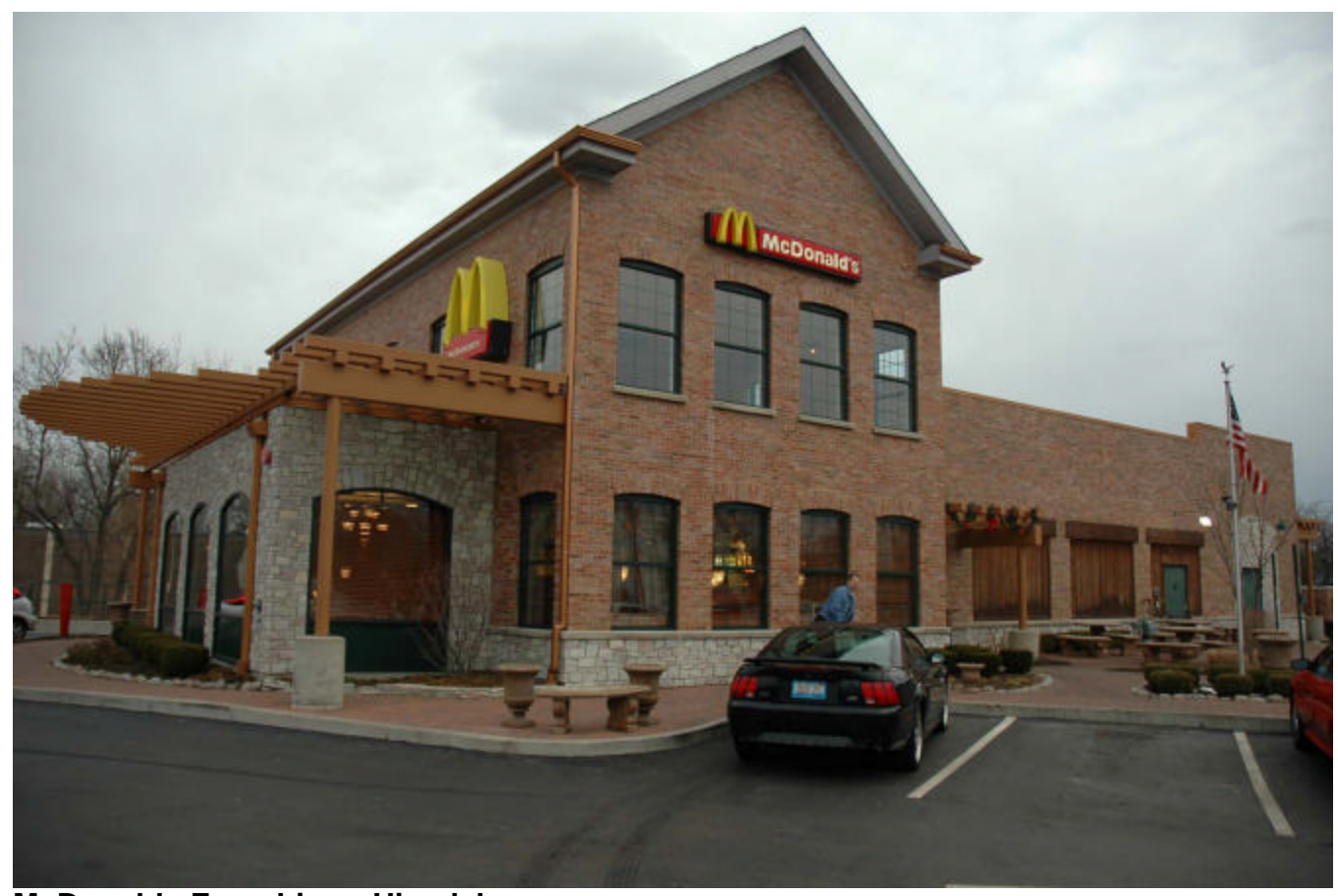
McDonalds Franchise – Hinsdale