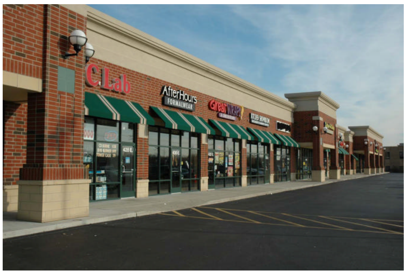
Roosevelt Road – Lombard