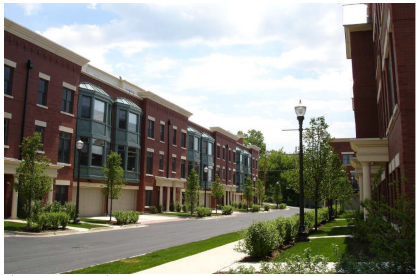
River Park Place - Elgin