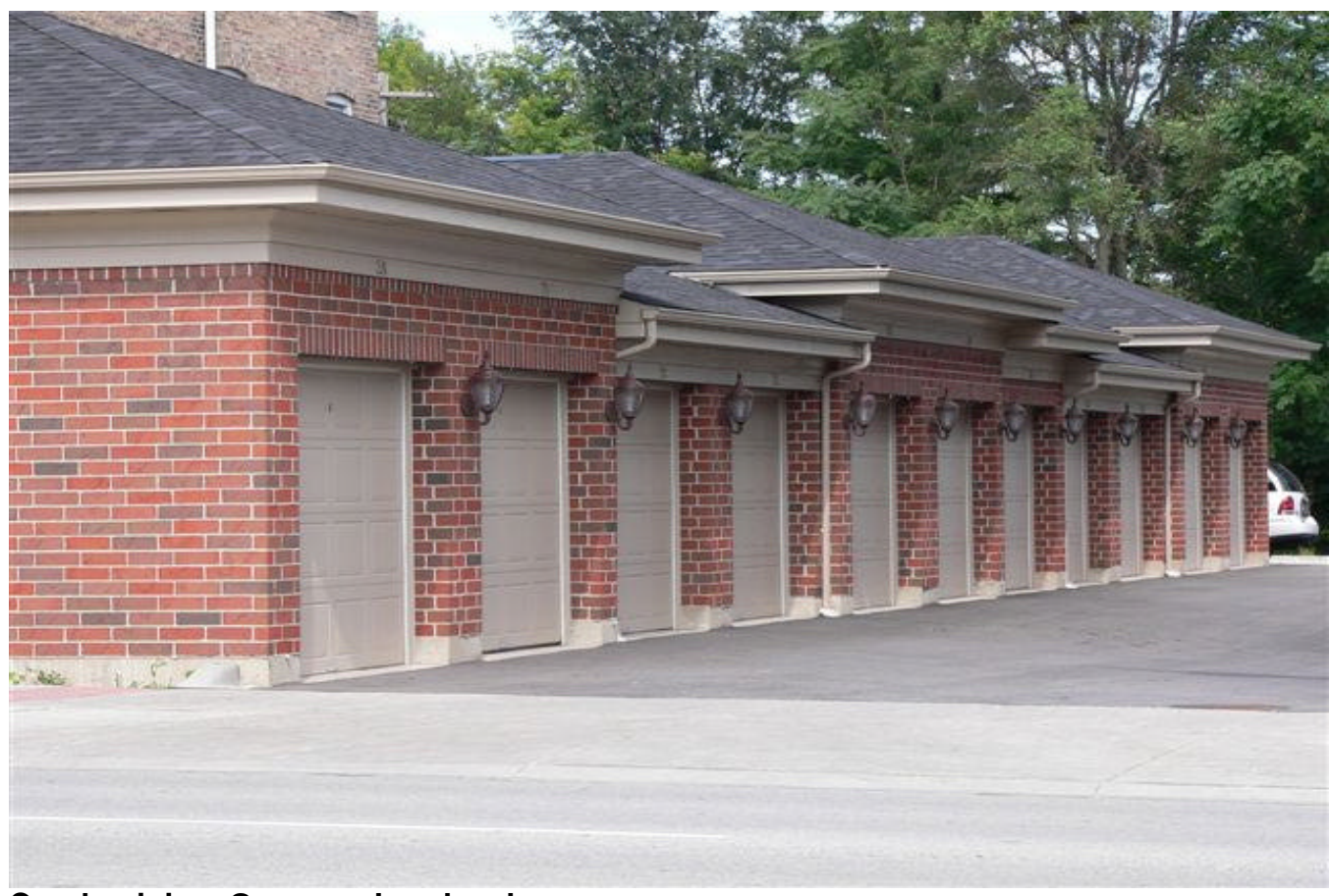
Condominium Garages- Lombard