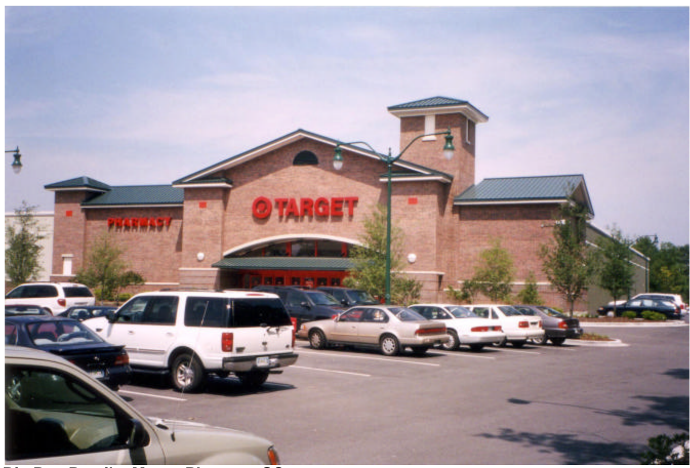
Big Box Retail - Mount Pleasant, SC