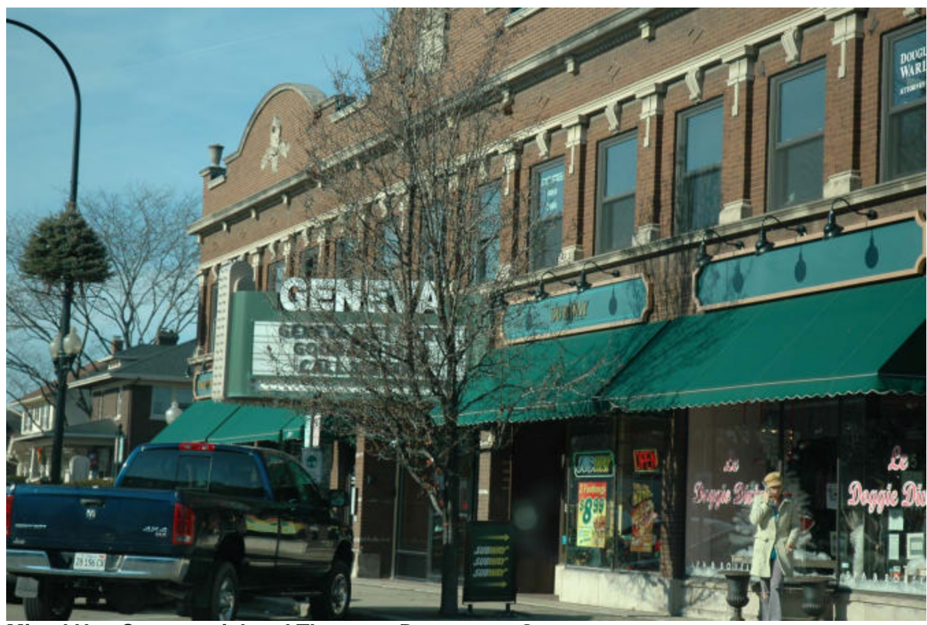
Mixed Use Commercial and Theater - Downtown Geneva