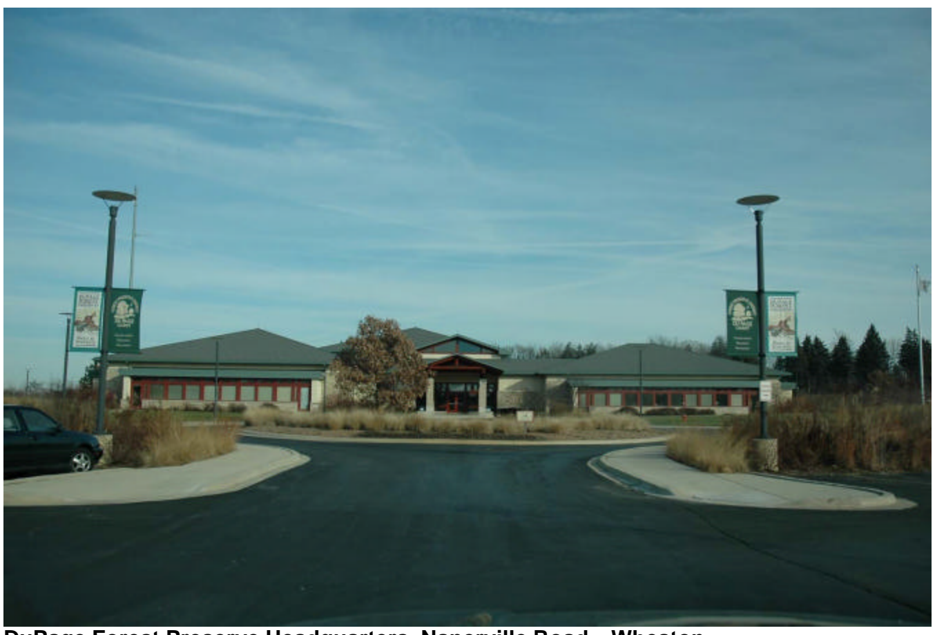
DuPage Forest Preserve Headquarters, Naperville Road – Wheaton