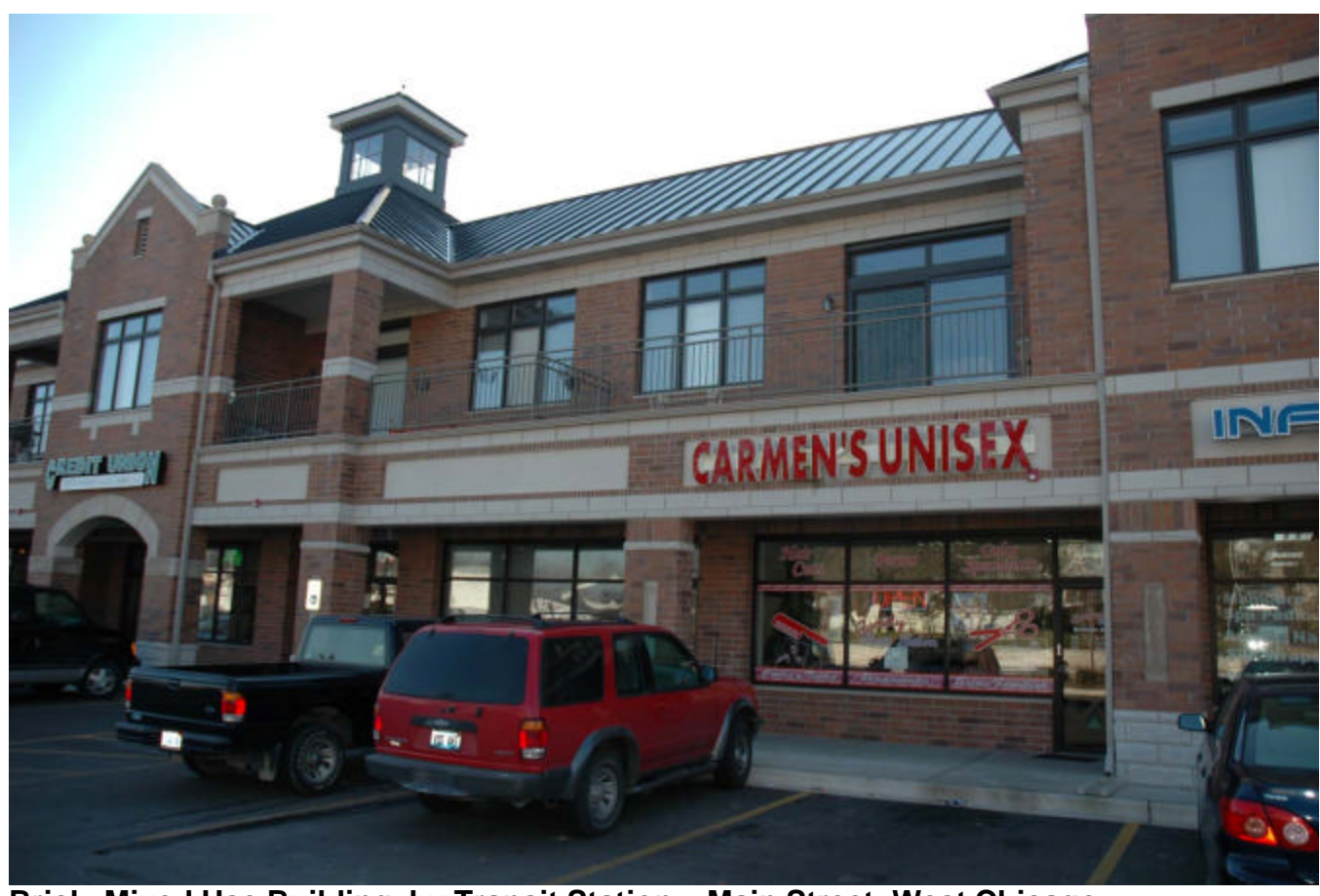
Brick, Mixed Use Building, by Transit Station – Main Street, West Chicago