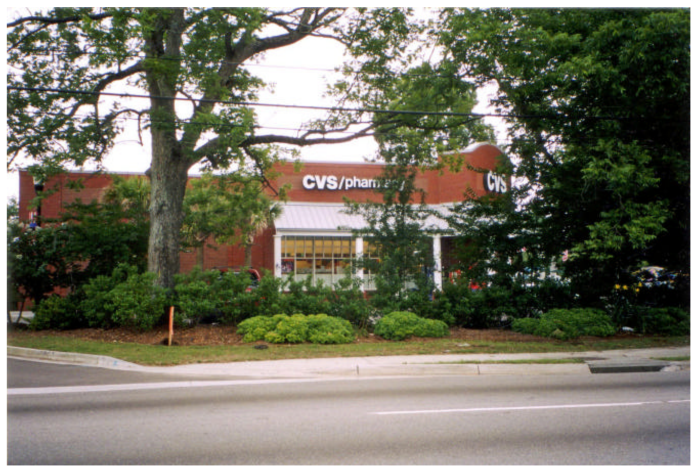
Pharmacy – Mount Pleasant, SC