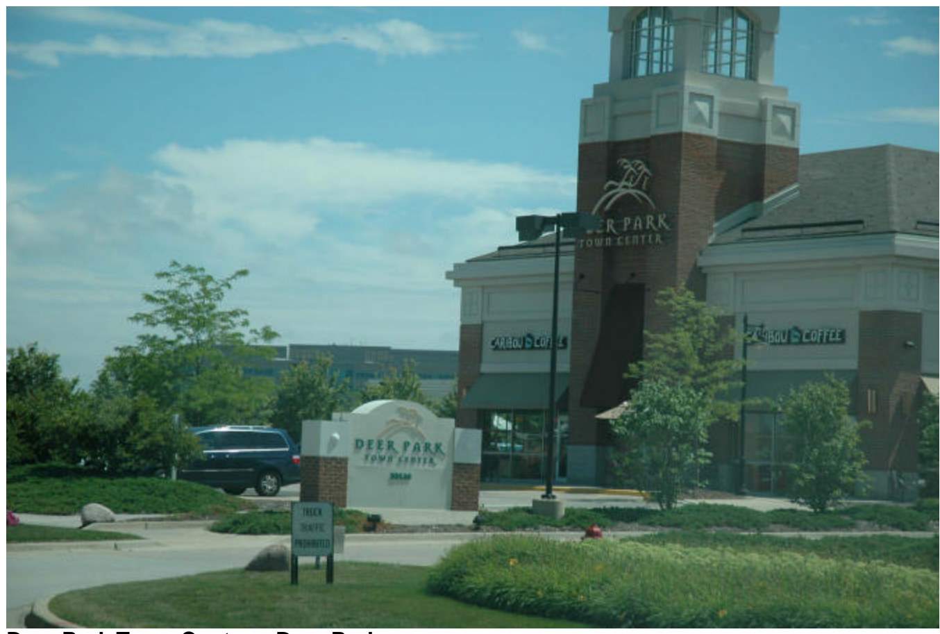
Deer Park Town Center – Deer Park