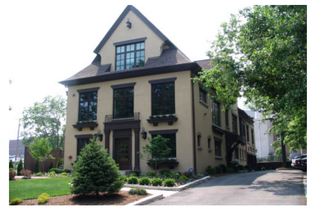
475 Duane Street – Glen Ellyn