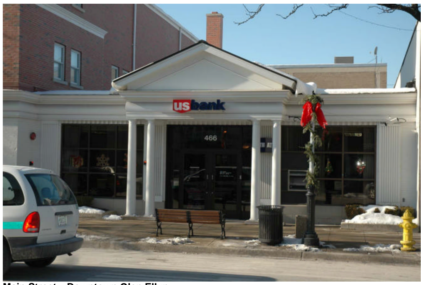
Main Street – Downtown Glen Ellyn

• Historical style and architectural detailing