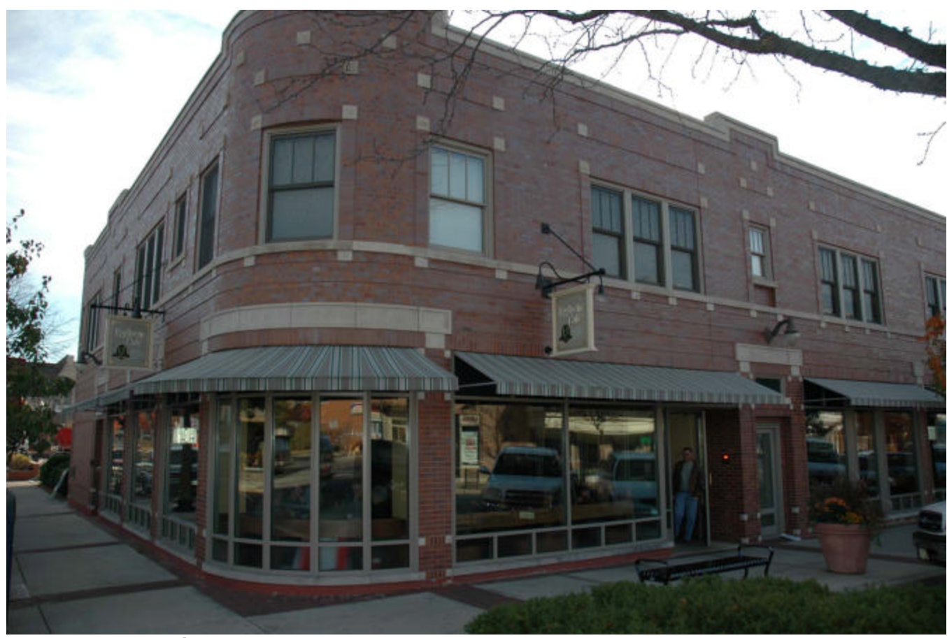
Façade Restoration – Wesley and Hale, Downtown Wheaton