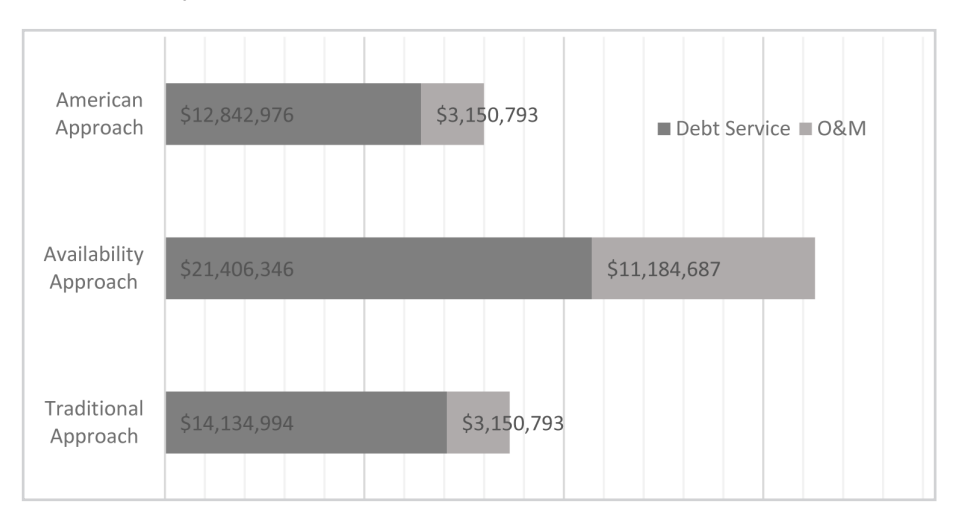
FIGURE 2 Final Lease Payments