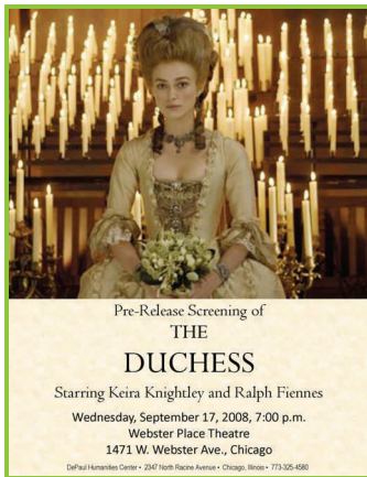
Pre-Release Screening The Duchess