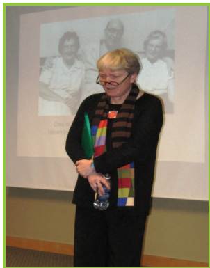
Terry Castle Stanford University Brunette and Philip: Reading Philip Larkin's Lesbian Fiction of the 1940s

"This lecture is about the English poet Philip Larkin's early 'lesbian stories', 'The Trouble at Willow Gables' and 'Michelmas Term At St. Bride's', written when he was a student at Oxford and never published until five or six years ago.