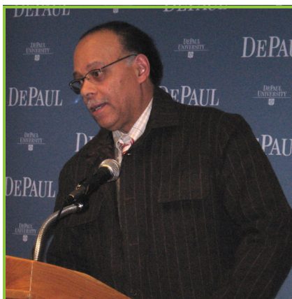
Haki R. Madhubuti