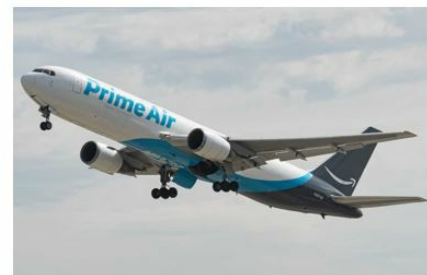
An Amazon Boeing 767 -323 (ER) departs from Ontario International Airport on July 10, 2021