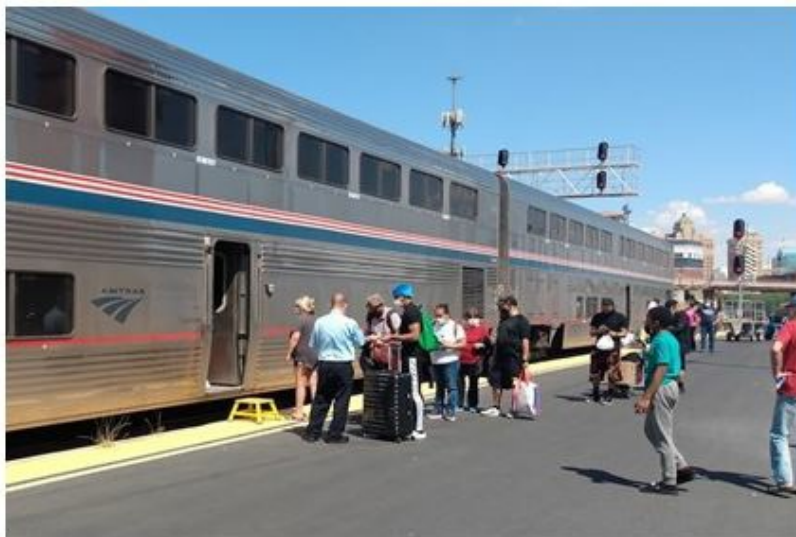
Amtrak's Sunset Limited is boarding at El Paso in September 2021

[1] For a discussion of our methodology, which uses estimates based on publicly available data, see our August Brief .